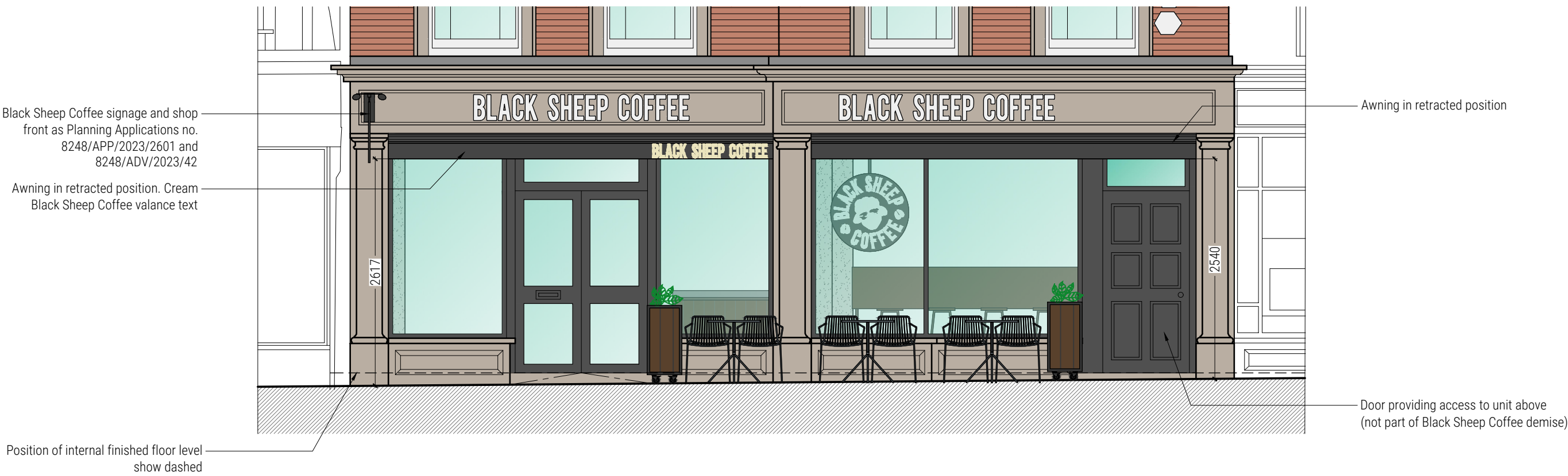
Proposed Shopfront Elevation (awning retracted)