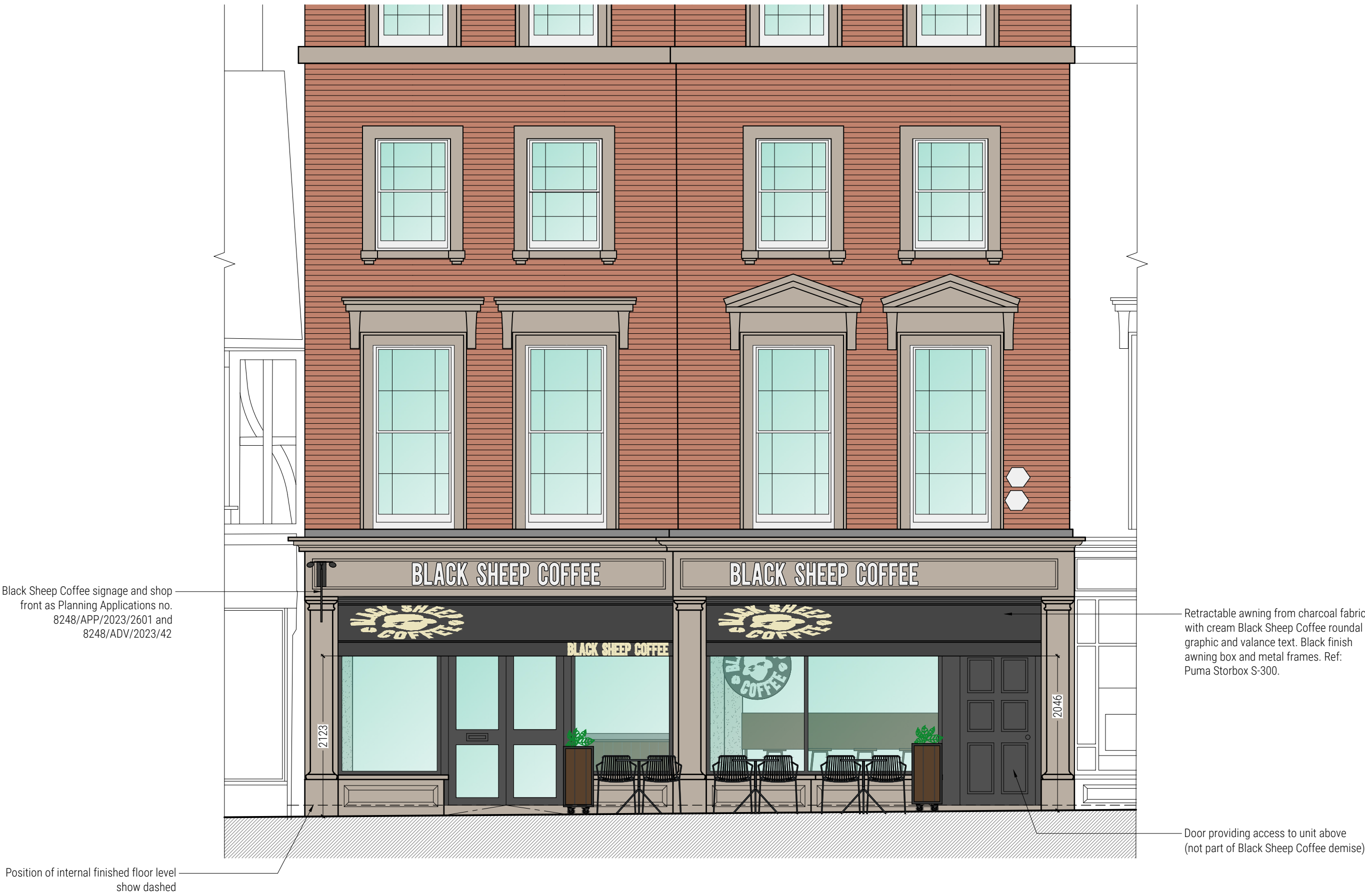
Proposed Shopfront Elevation (awning extended)