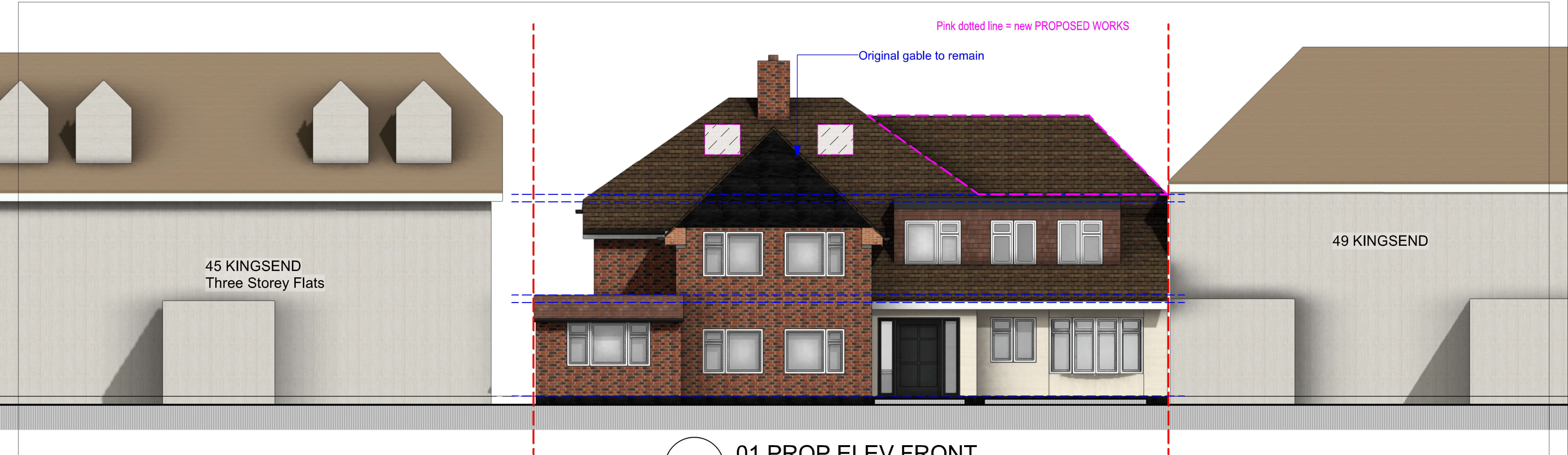
01 01 PROP ELEV FRONT Scale: 1:100

Pink dotted line = new first floor rear extension roof which is 500mm lower than main existing roof. The roof has not been raised.