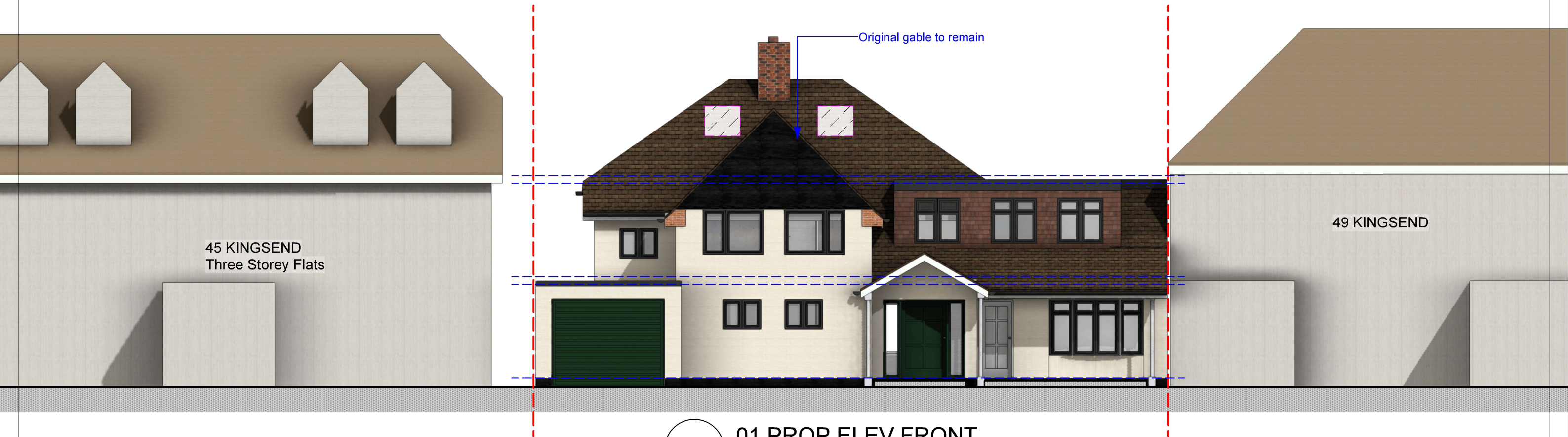
01 01 PROP ELEV FRONT Scale: 1:100