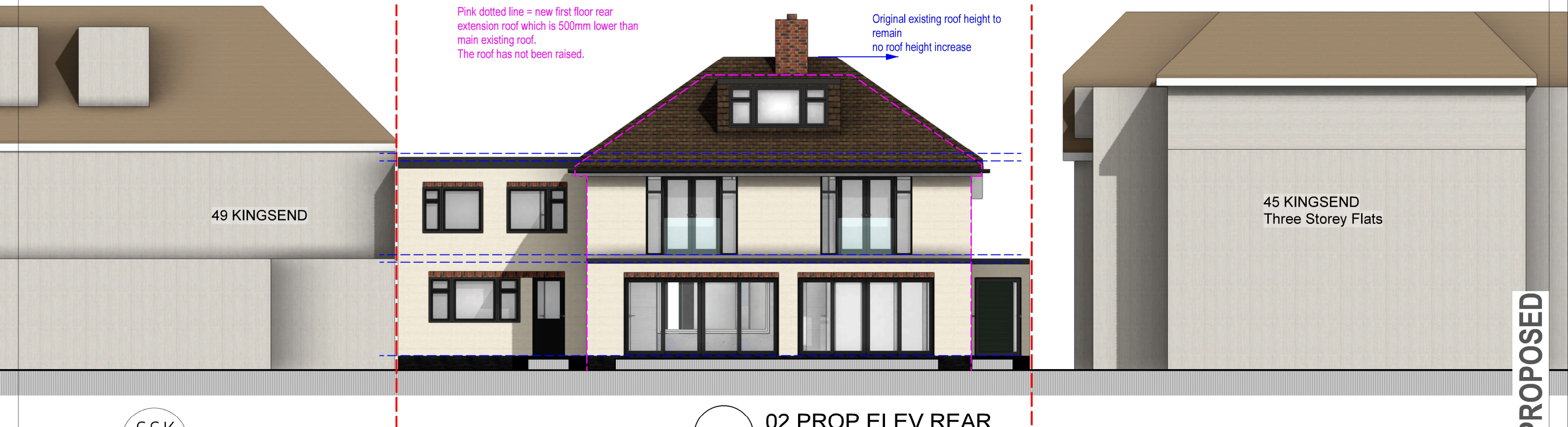
02 02 PROP ELEV REAR Scale: 1:100