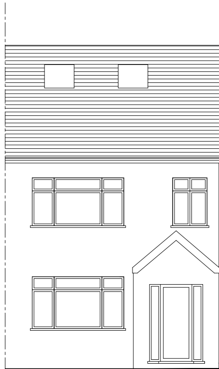
PROPOSED FRONT ELEVATION (No Change)