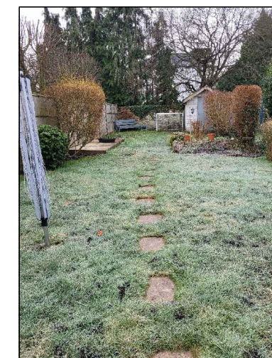
A VIEW OF REAR GARDEN