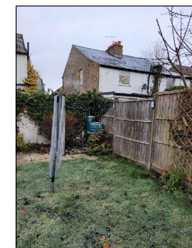
REAR ELEVATION NO:59