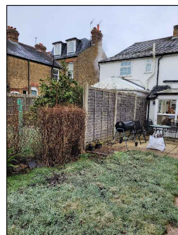
REAR ELEVATION NO:61