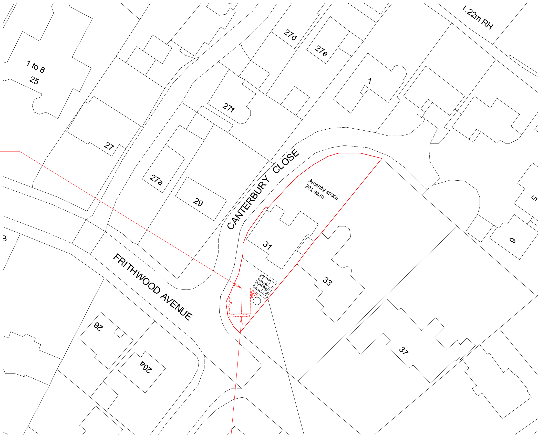
Proposed Site Plan Scale 1:500

Driveway surfacing: To be Tobermore Hydropave Tegula Permeable paving blocks, 240x120x80mm colour : Slate ( grey ), laid 90 degree herringbone on suitabl permeable bedding and sub-base strictly in accordance with manufacturer's specifications