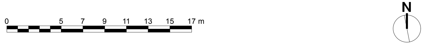
1:200 @A3 Block Plan