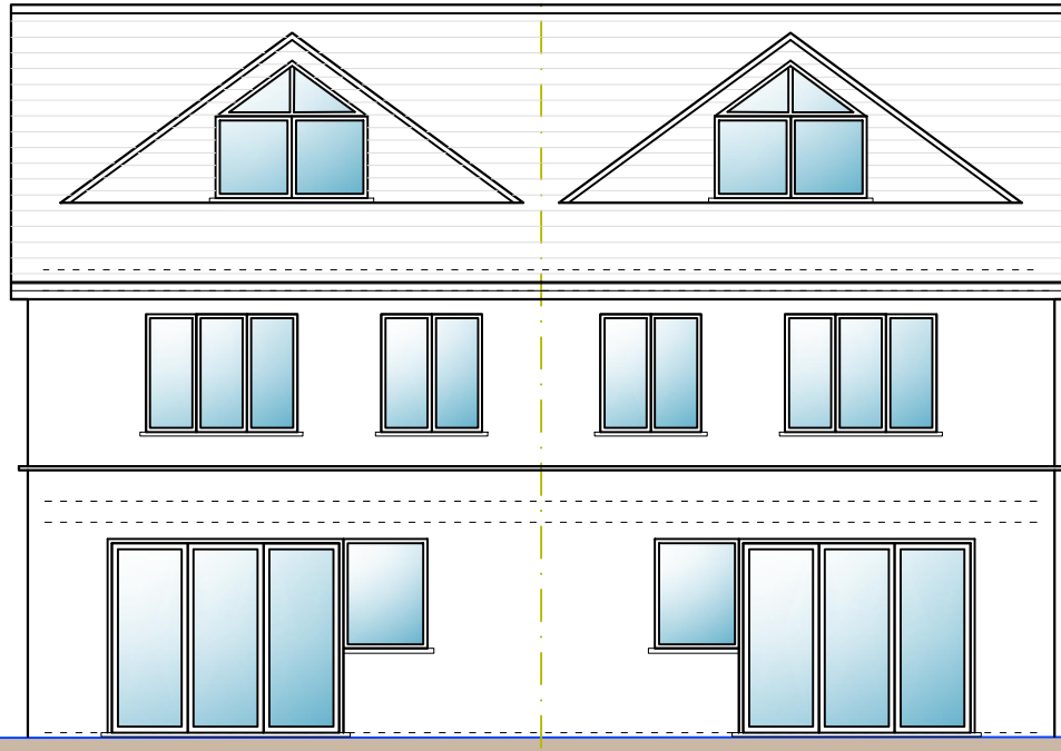
○ Rear Elevation 1:100