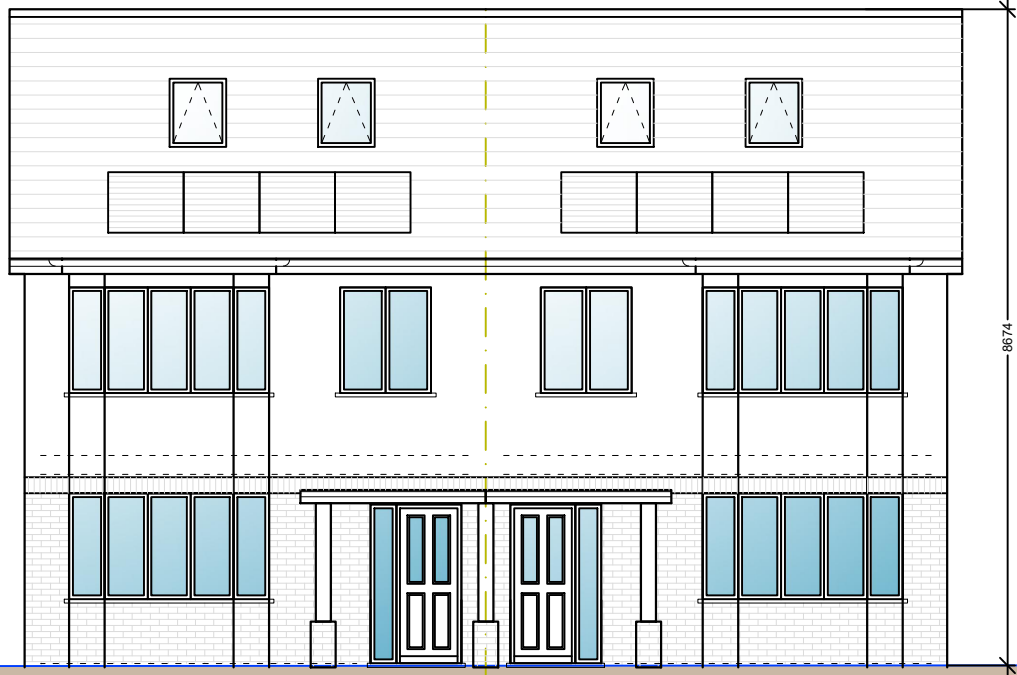
○ Front Elevation 1:100