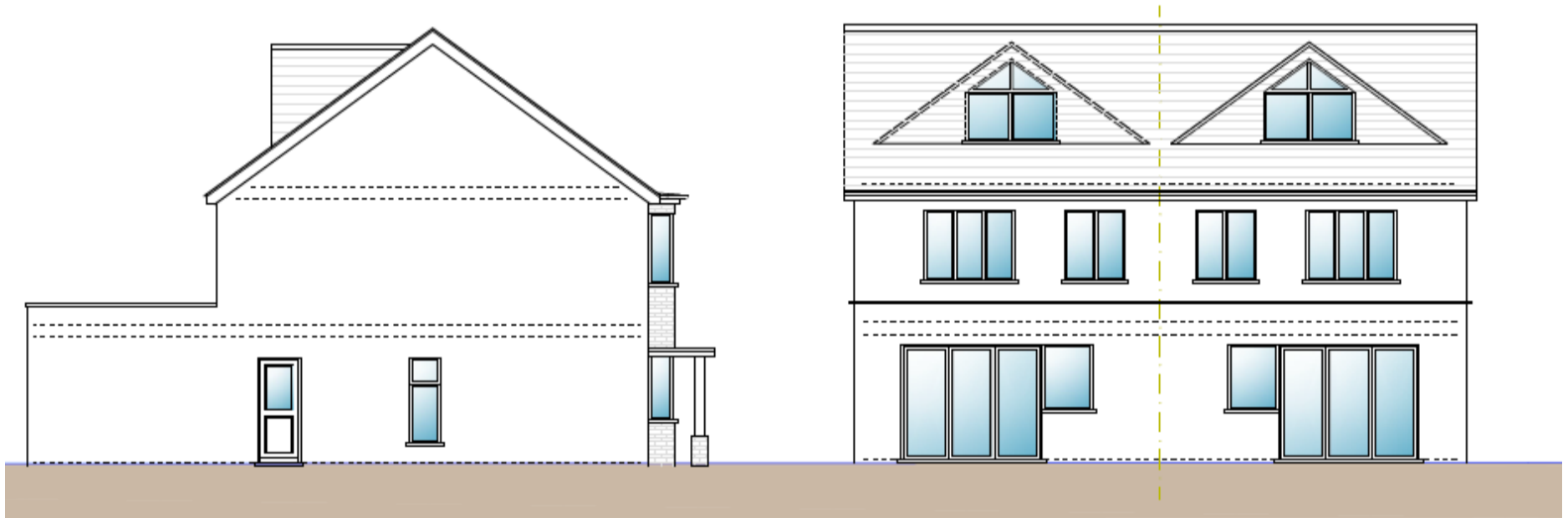
○ Side Elevation 2 1:100