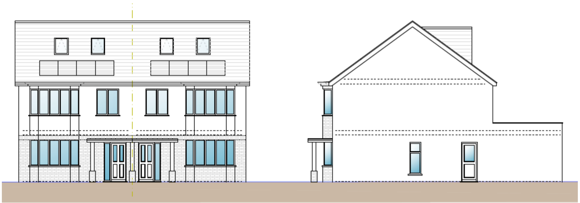
○ Front Elevation 1:100