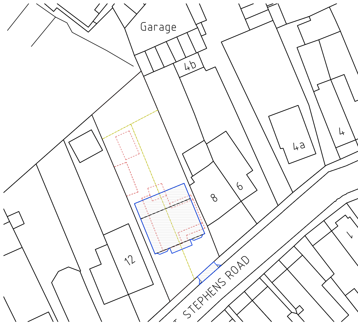
Block Plan 1 : 5 0 0