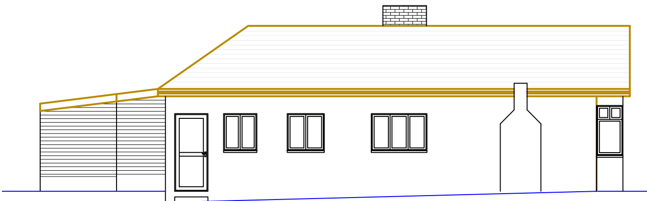
○ Side Elevation 2 1:100