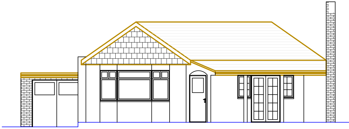
○ Front Elevation 1:100