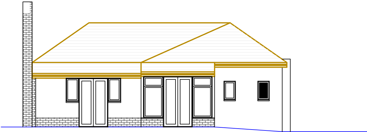
○ Rear Elevation 1:100