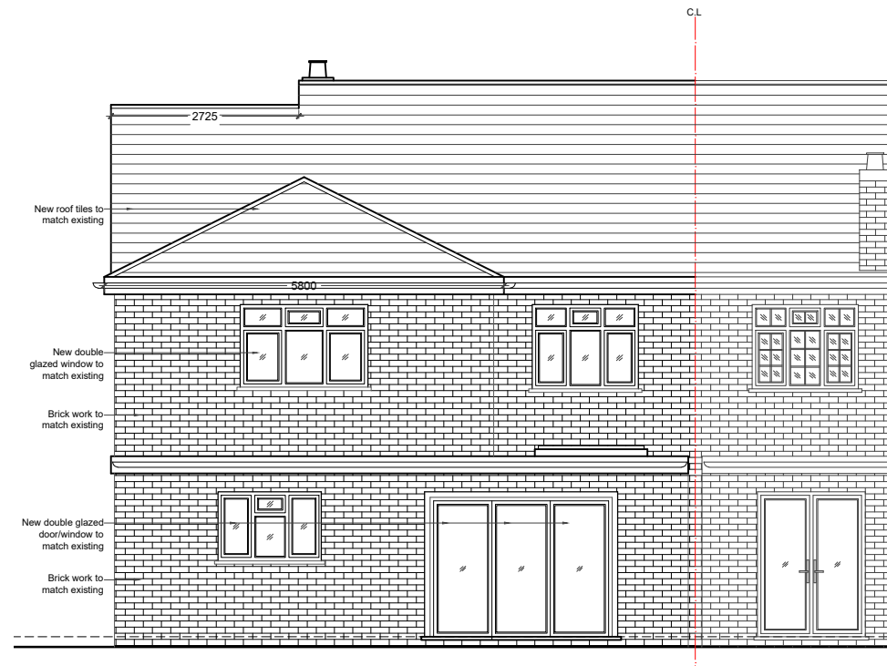
02 - REAR ELEVATION