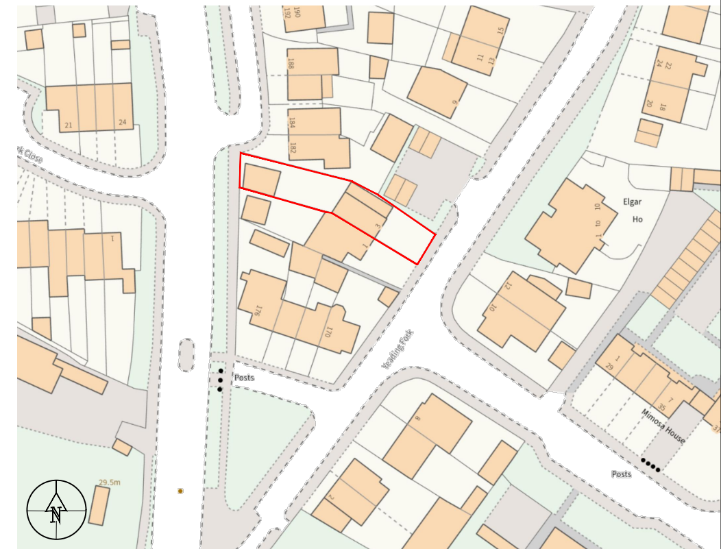
01 - OS MAP SCALE 1:1250