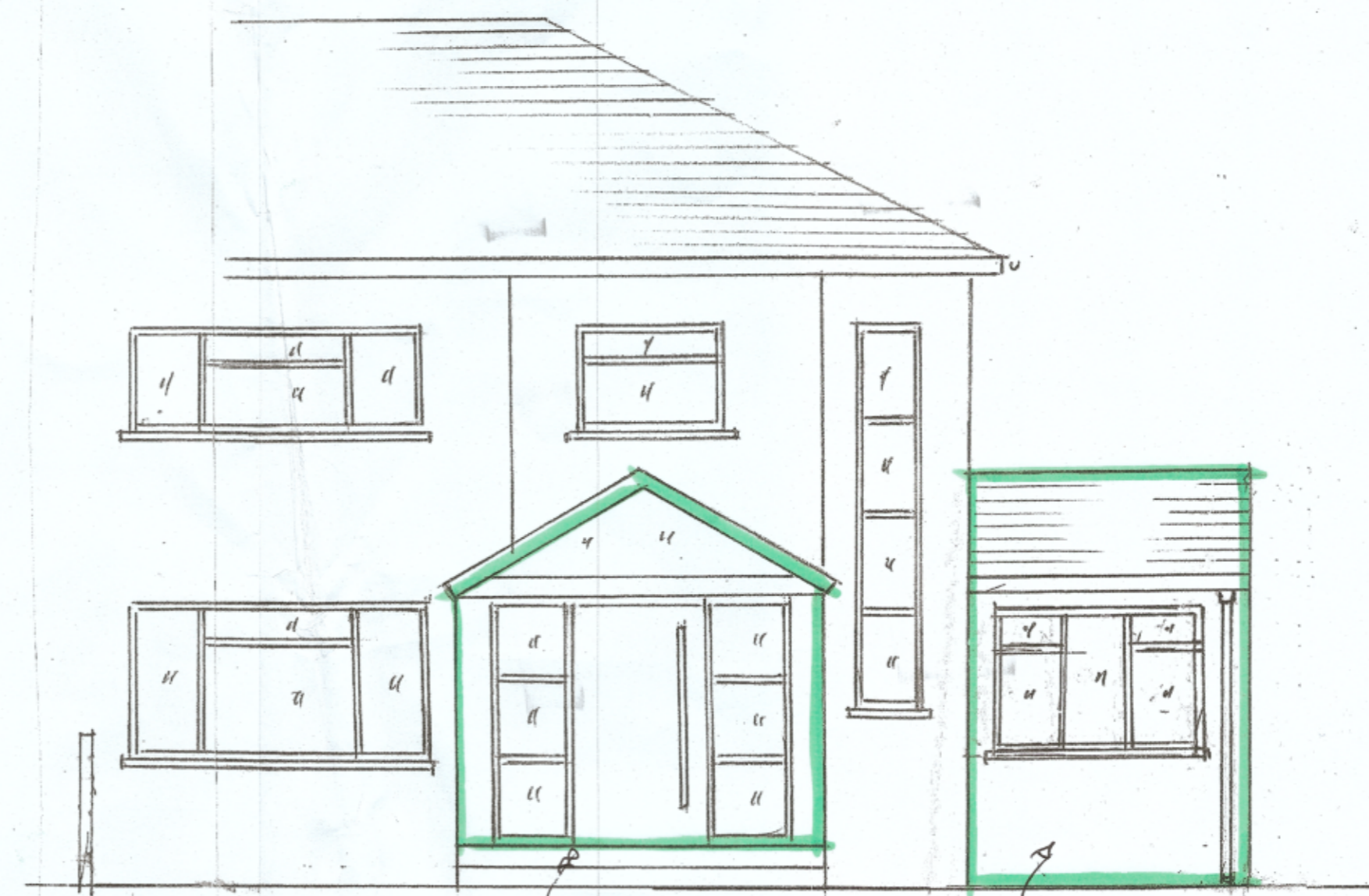
Proposed Front Elevation (NEW WORK OUTLINED IN GREEN)