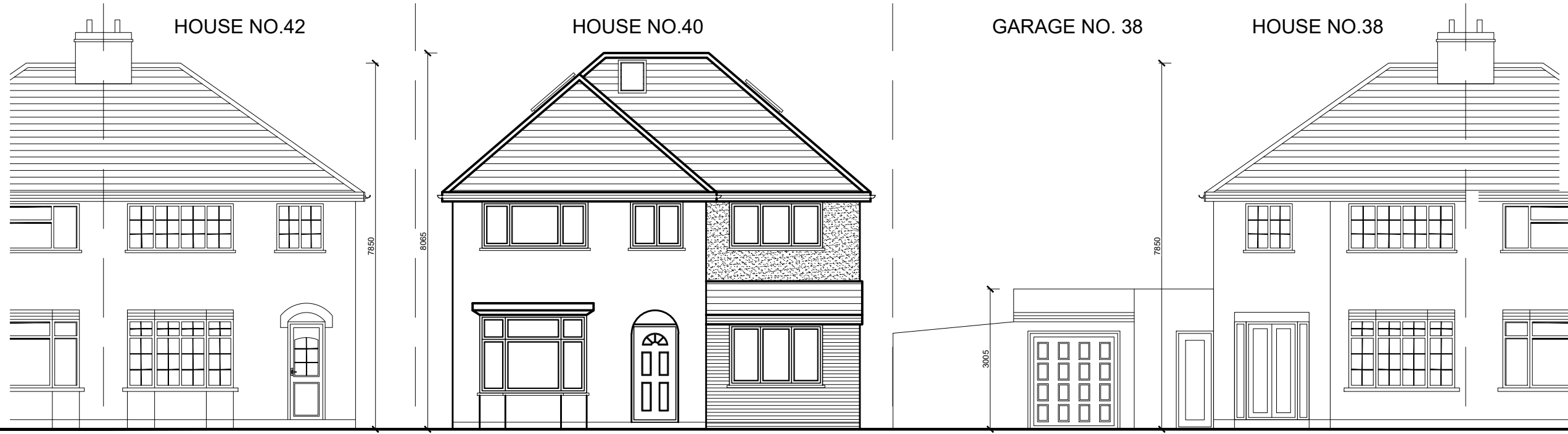
PROPOSED STREET SCENE

The Contractor is to check all dimensions on site and report any discrepancies to the Contract Administrator. This drawing is to be read in conjunction with all other standard documentation.