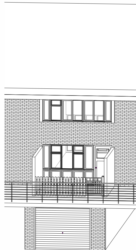
Existing - 3D Model 1:100