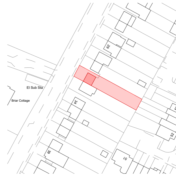
Site Location Plan @ 1 : 1250