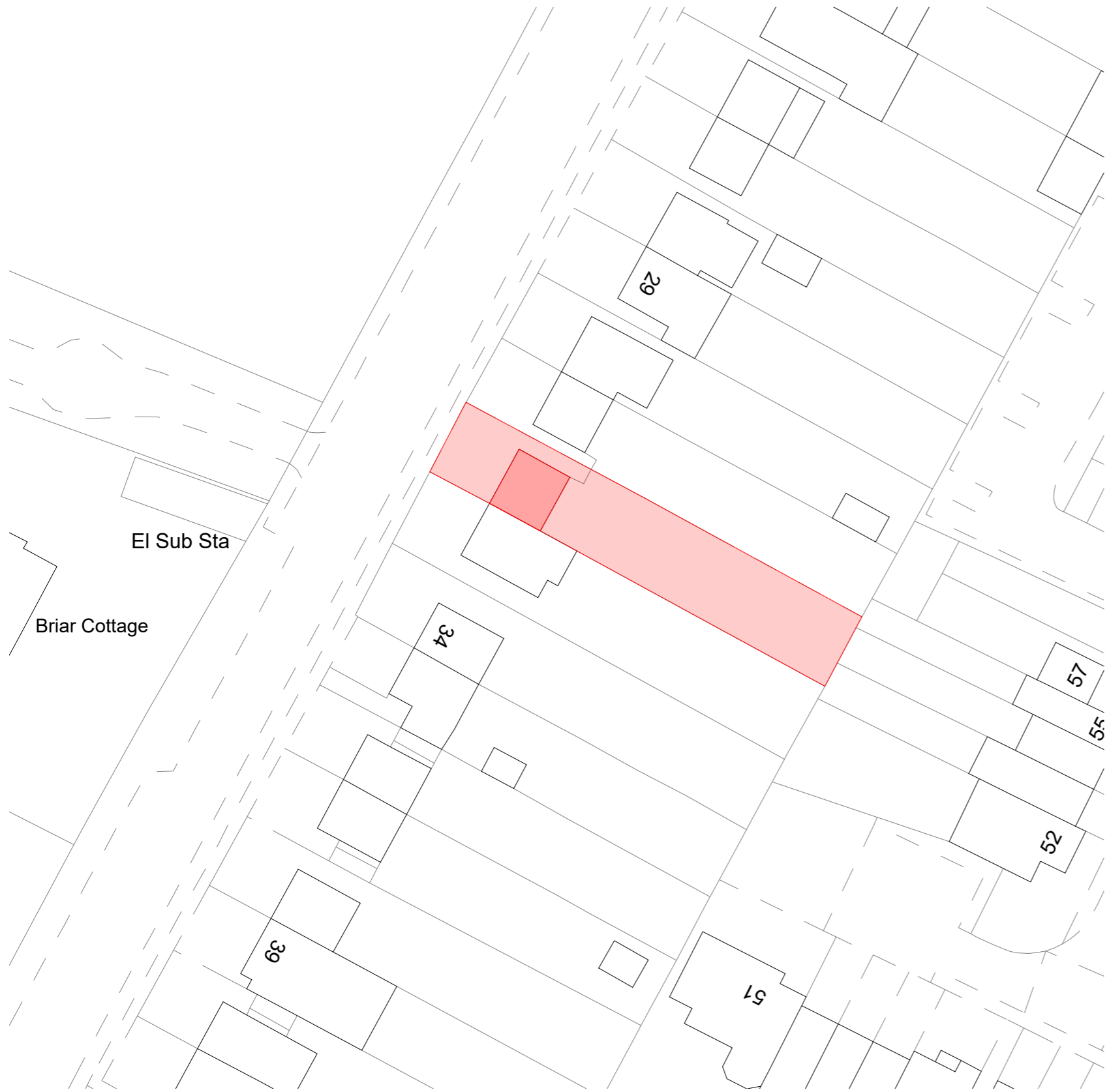
Site Block Plan @ 1 : 500