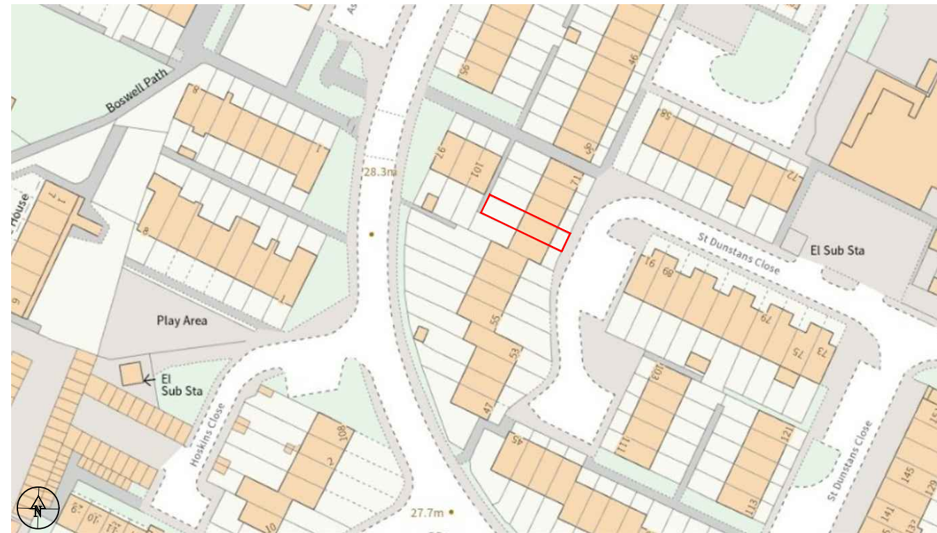
03 - OS MAP SCALE 1:1250