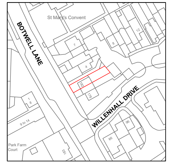
LOCATION PLAN SCALE 1:1250 @ A3