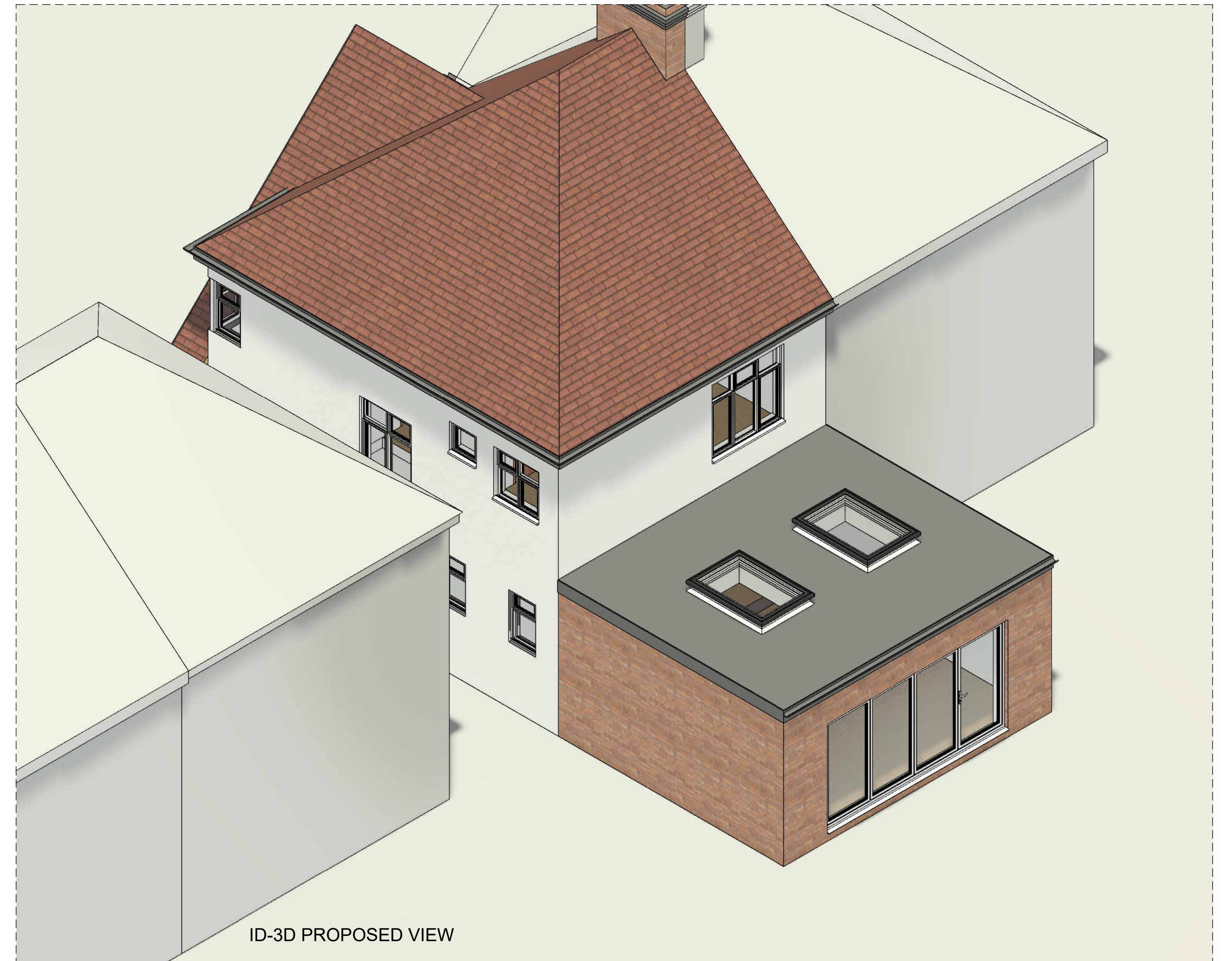
ID-3D PROPOSED VIEW