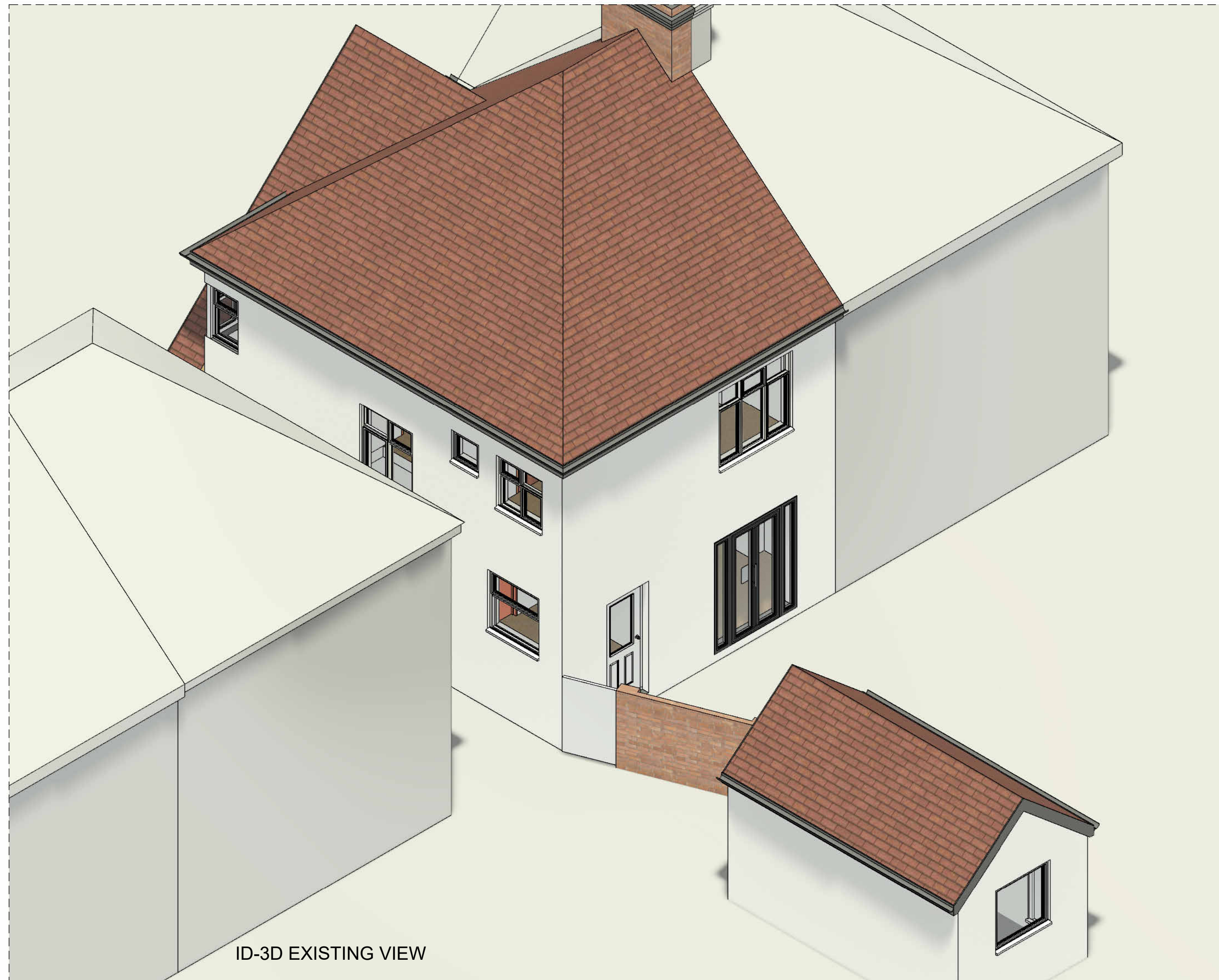
ID-3D EXISTING VIEW