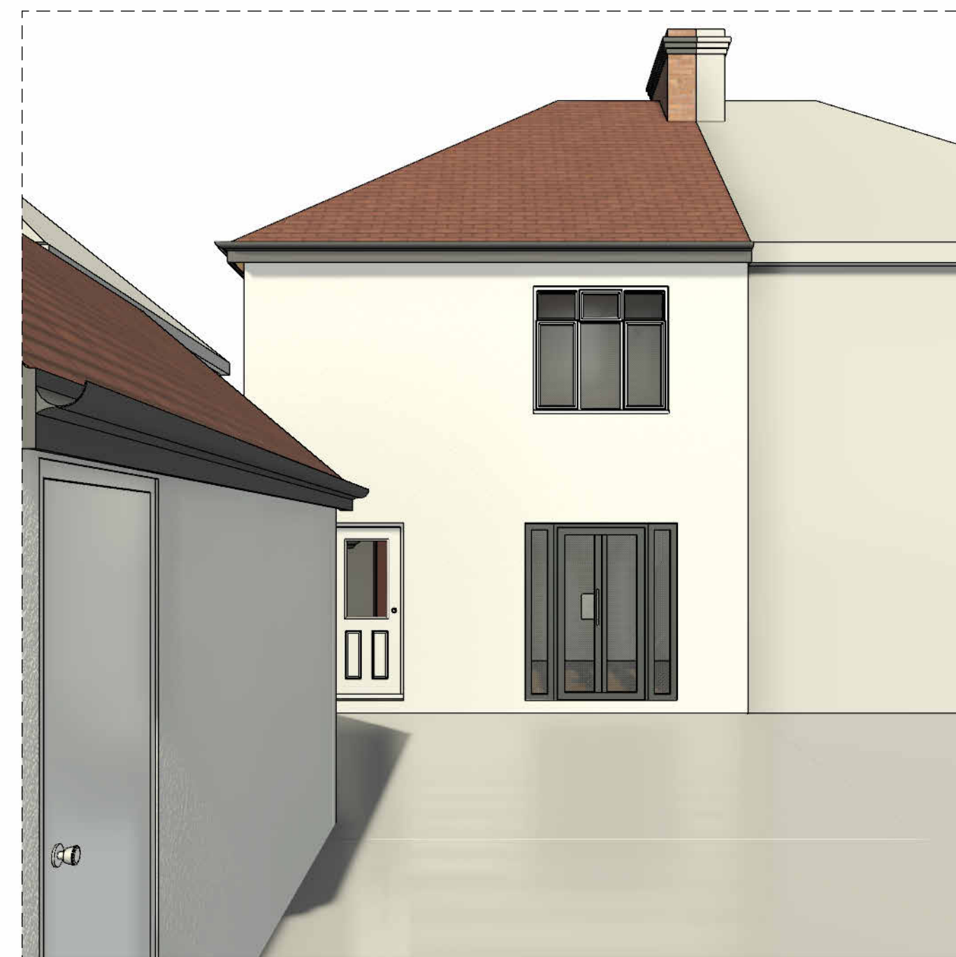
ID-EXISTING REAR VIEW