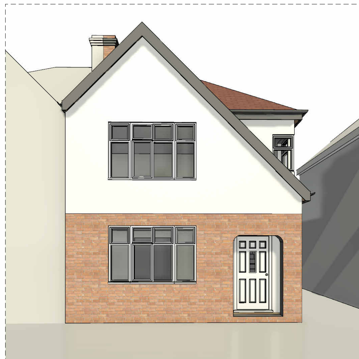
ID-EXISTING FRONT VIEW