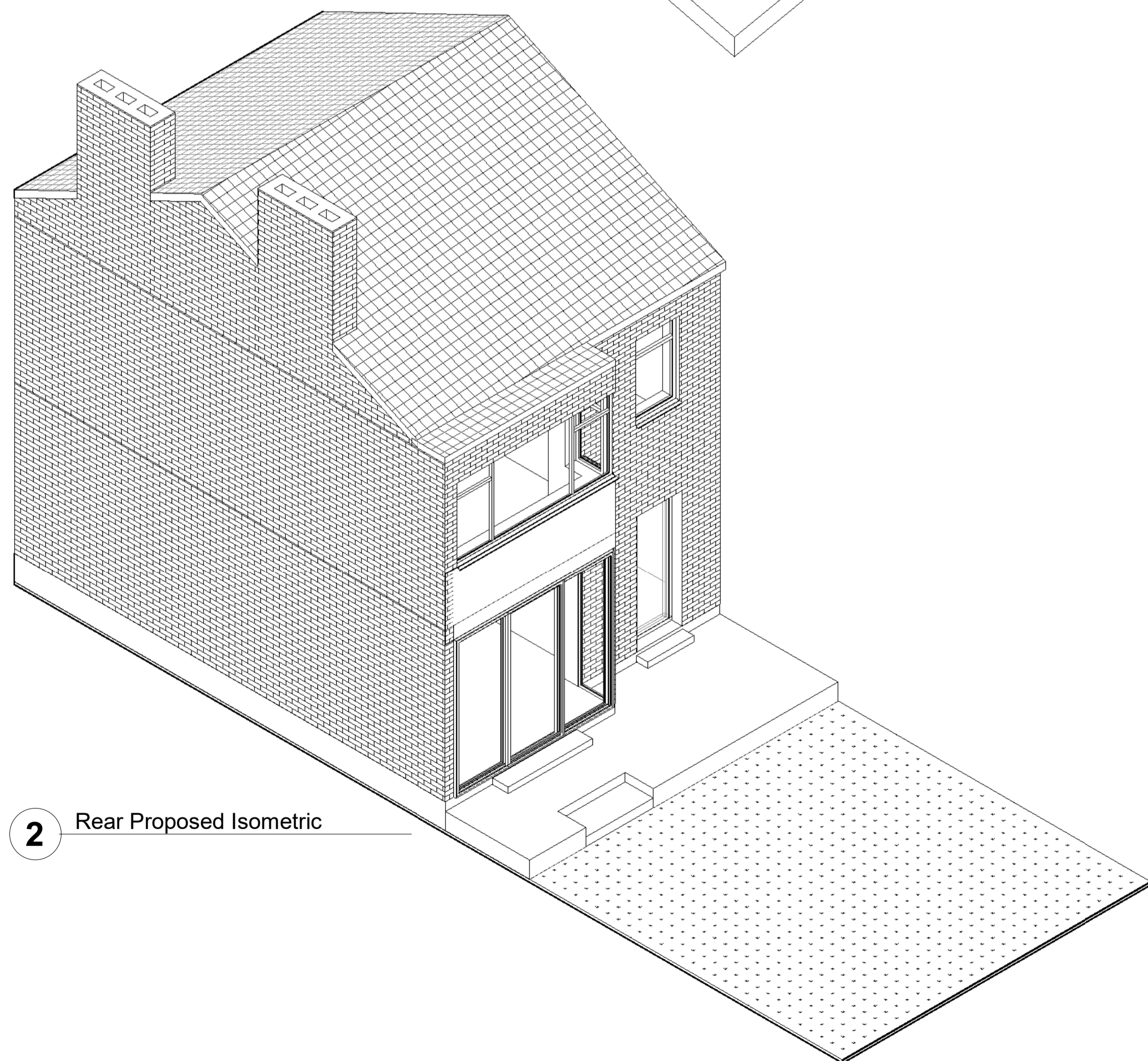
2 Rear Proposed Isometric