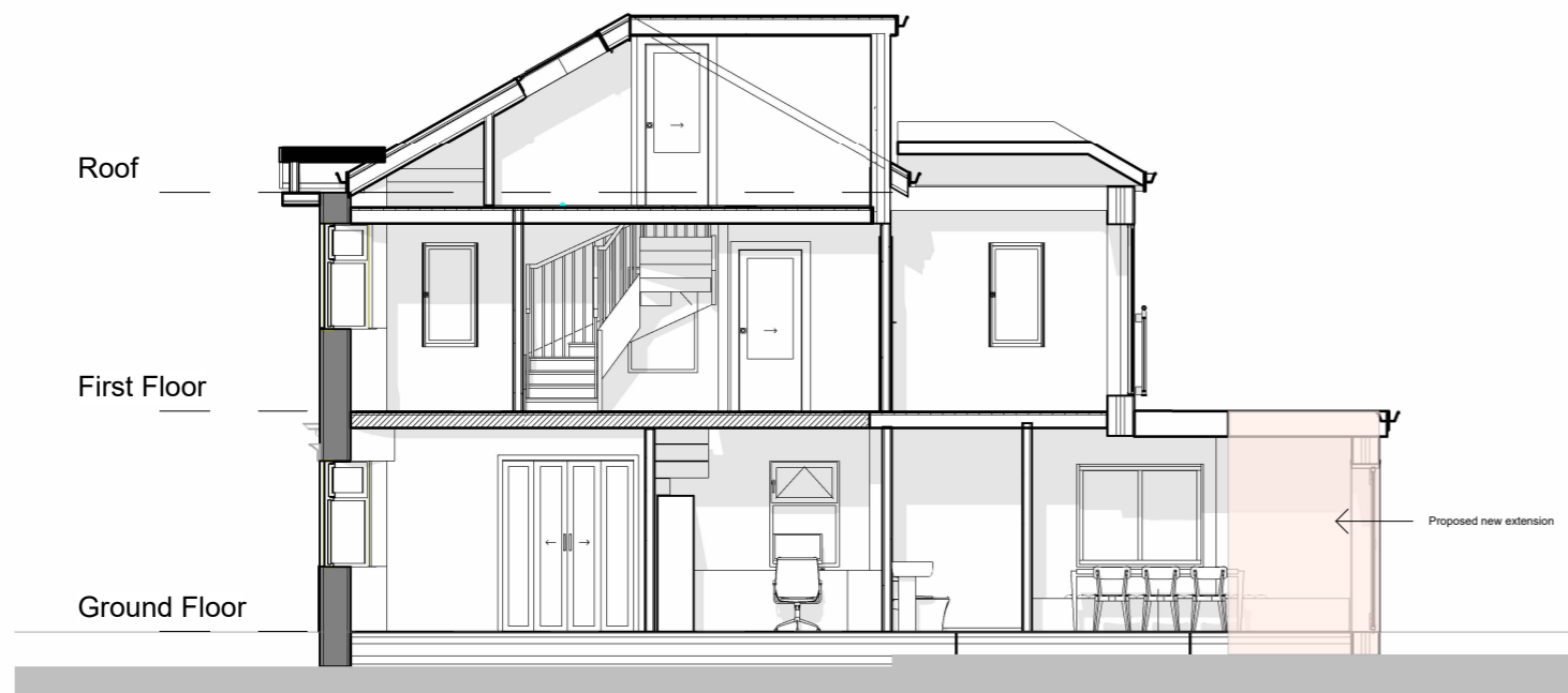
Proposed Section A-A 1:100