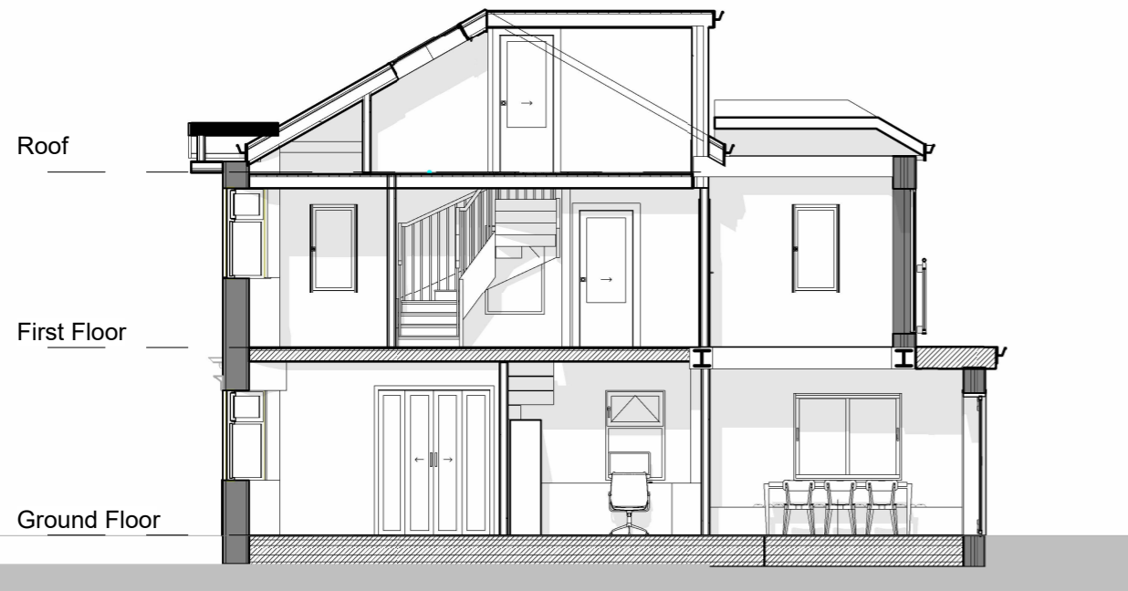
Existing Section A-A 1:100