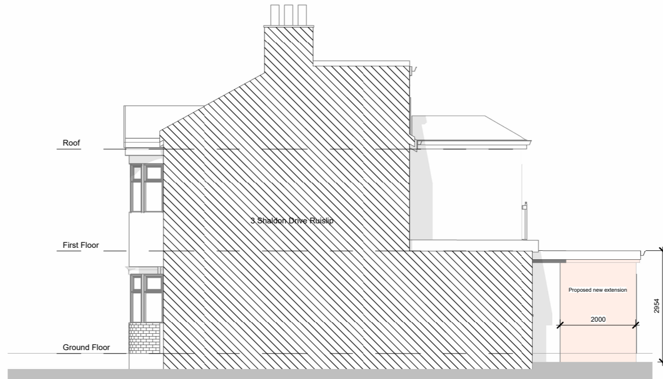
Proposed Right Side Elevation 1:100