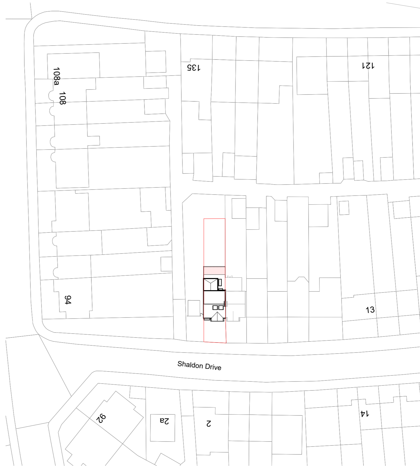
Block Plan1 1 : 500

Note This drawing may be scaled for the purposes of Planning Applications, Land Registry and for Legal plans where the scale bar is used, and where it verifies that the drawing is an original or an accurate copy. It may not be scaled for construction purposes. Always refer to figured dimensions. All dimensions are to be checked on site. Discrepancies and/or ambiguities between this drawing and information given elsewhere must be reported immediately to this office for clarification before proceeding. All drawings are to be read in conjunction with the specification and all works to be carried out in accordance with latest British Standards / Codes of Practice.