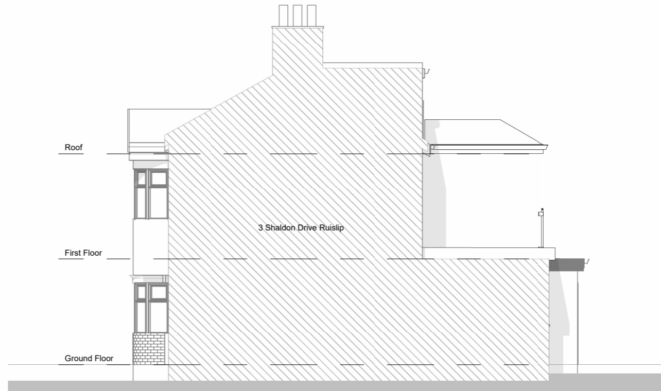
Existing Right Side Elevation 1:100