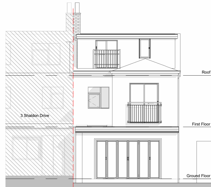
Existing Rear Elevation 1:100