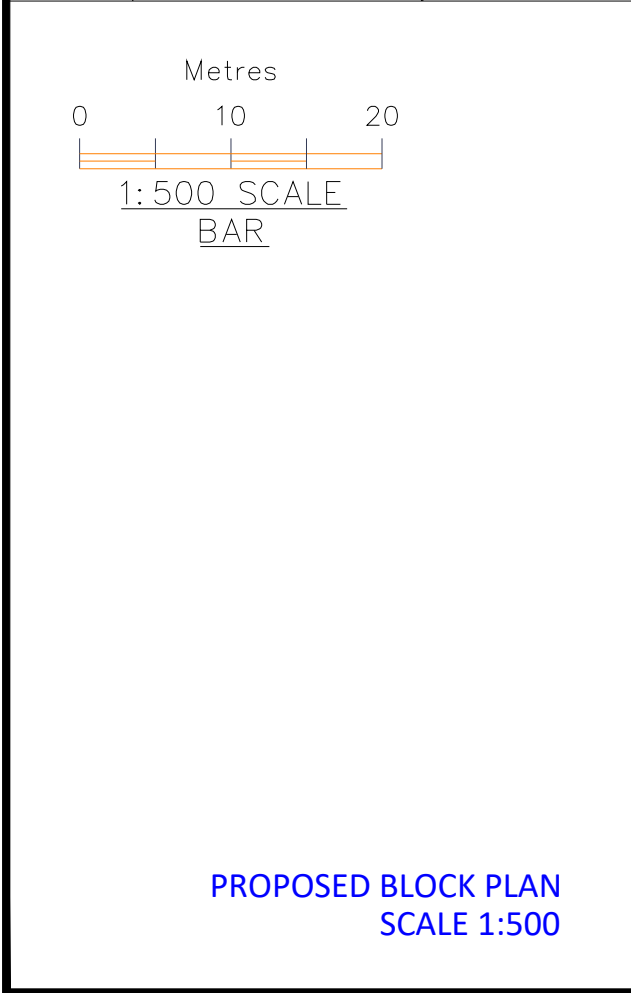
PROPOSED BLOCK PLAN SCALE 1:500