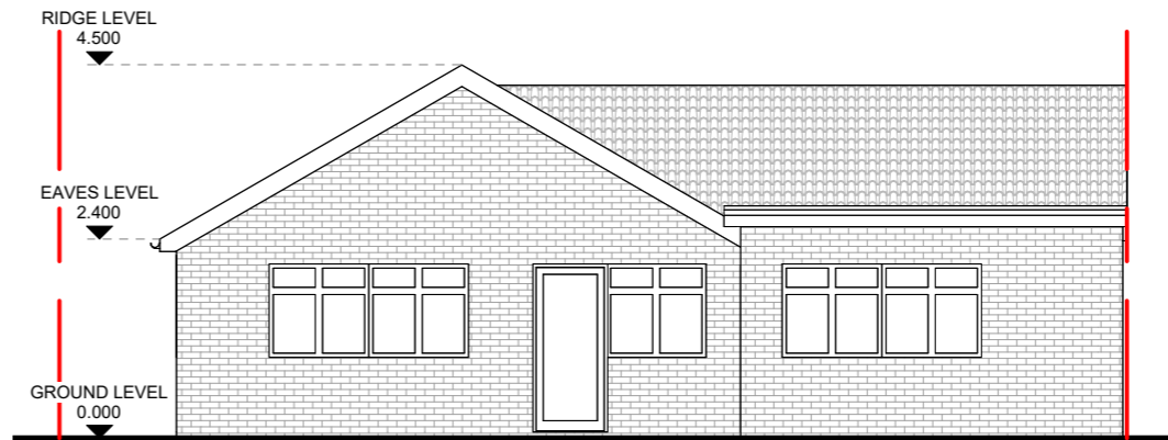
3 Rear Elevation (South) 1 : 100

This drawing is not for CONSTRUCTION purposes. If no dimension is given, we take no responsibility for any dimension obtained by measuring or scaling from this drawing. This drawing is the property of Maplin Studio Limited. It is copyright protected and is not to be reproduced, disclosed or copied without written permission.