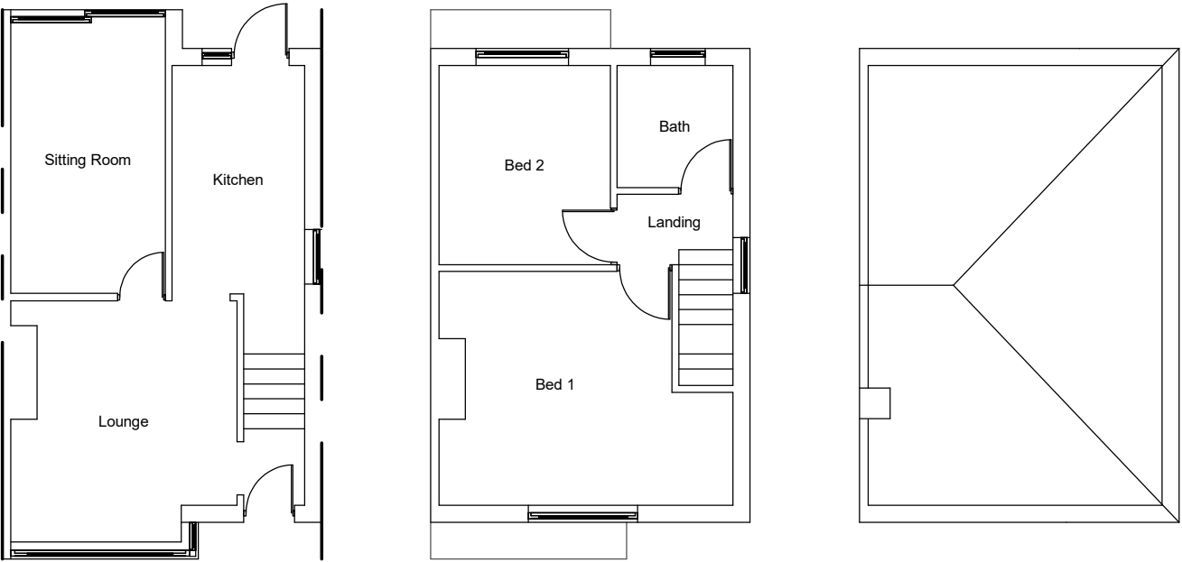
EXISTING GF / FF & ROOF LAYOUT Scale 1:100

REVNOTES: Where building to the boundaries the adjacent owner is to be informed under the terms of the Party Wall Act 1996 and its provisions followed. Where building over boundaries the adjacent owner is to be served notice under section 65 of the Town & Country Planning Act 1990. ©This drawing and the works depicted are the copyright of ASB PROPERTY CONSULTANTS LTD and may not be reproduced or amended except by written permission of ASB PROPERTY CONSULTANTS LTD.