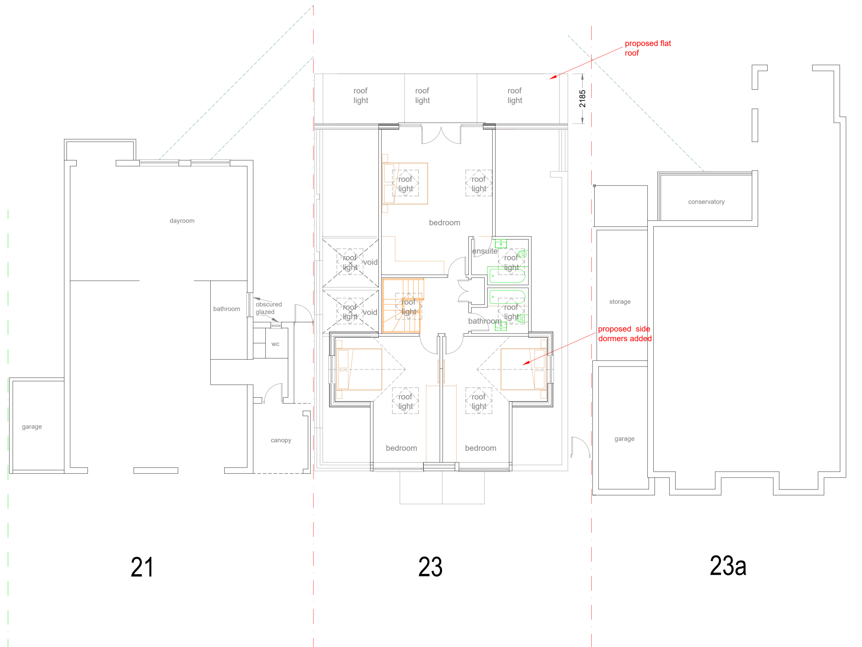
PROPOSED LOFT FLOOR LAYOUT SCALE:1-100

DISCLAIMER These drawings are for planning application purposes only and must NOT be used for structural calculations or any engineering purposes. IMPORTANT NOTE: All gutters, foundations and down pipes must remain within the boundary lines of the subject property. All boundary lines and dimensions must be checked and verified on site.