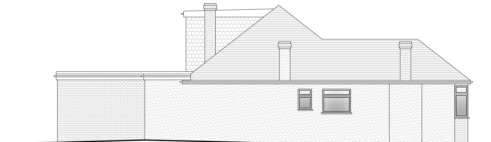
6 Proposed Side Elevation