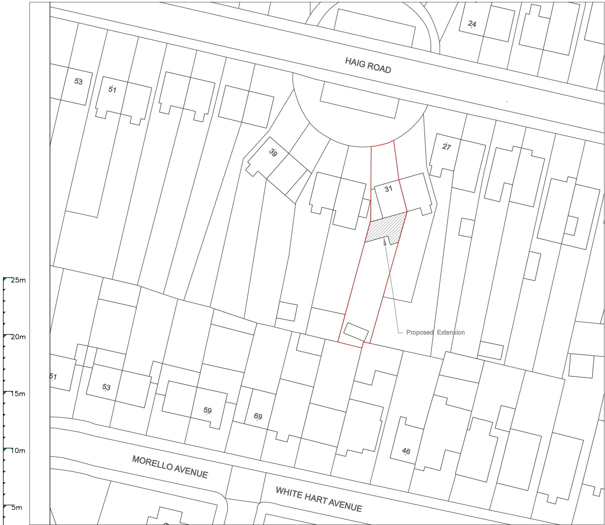
Site Plan 1:200