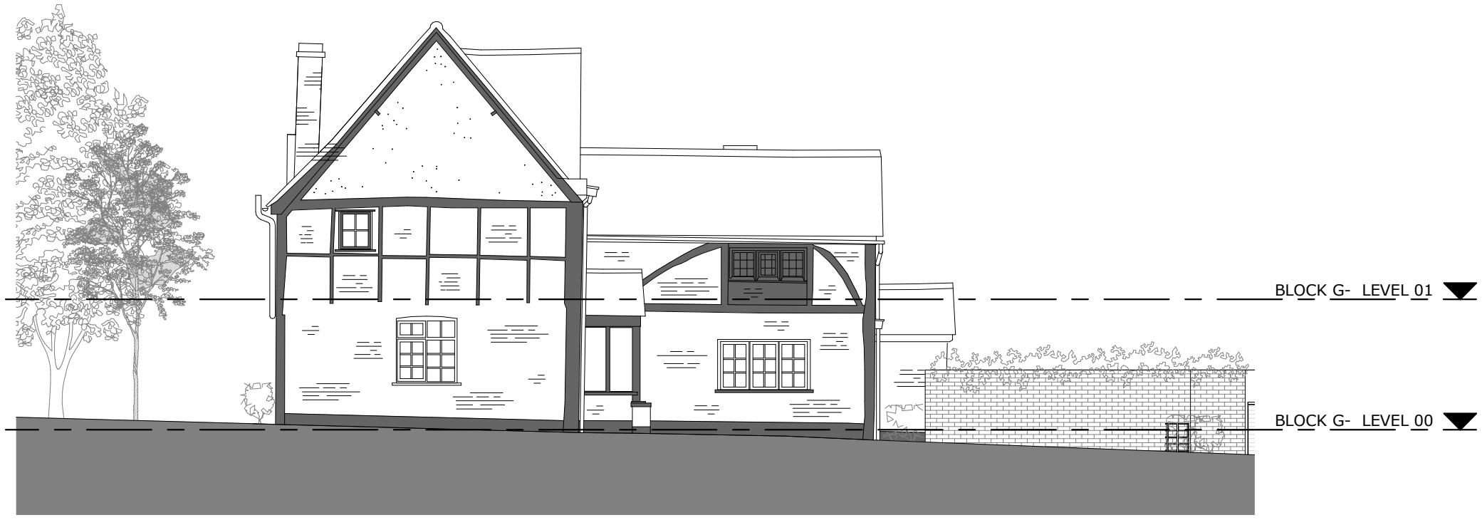
Block G - West Elevation SCALE: 1 : 100