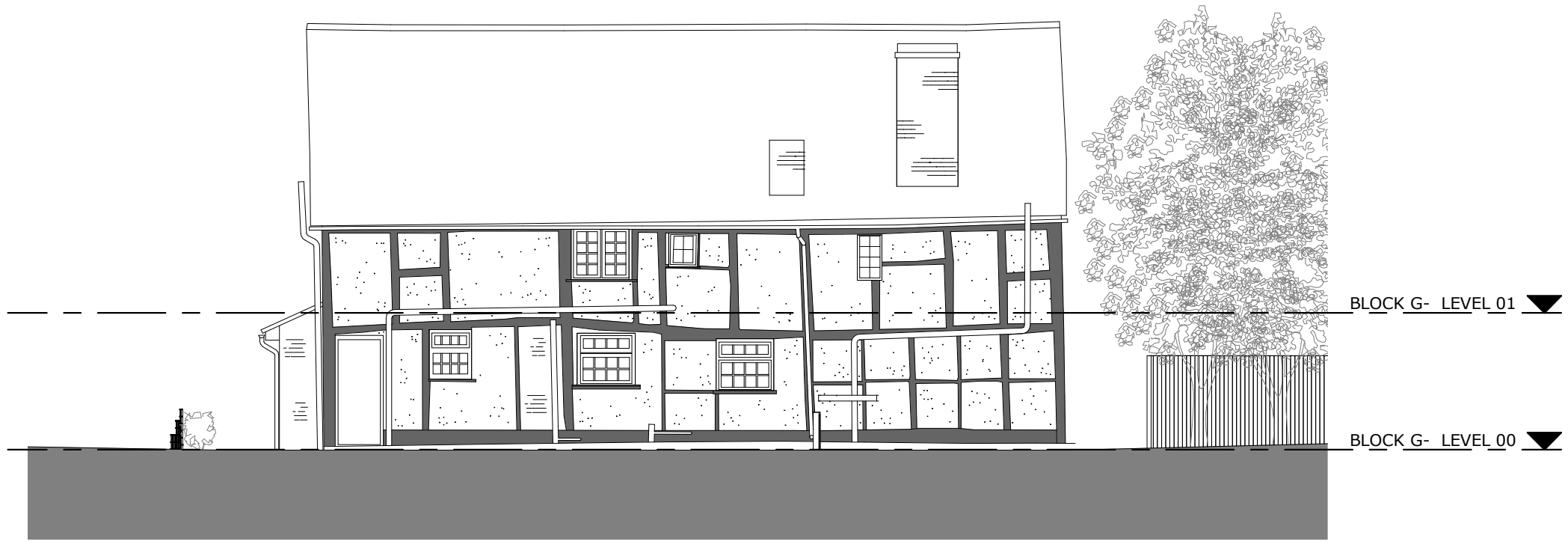
Block G - North Elevation SCALE: 1 : 100