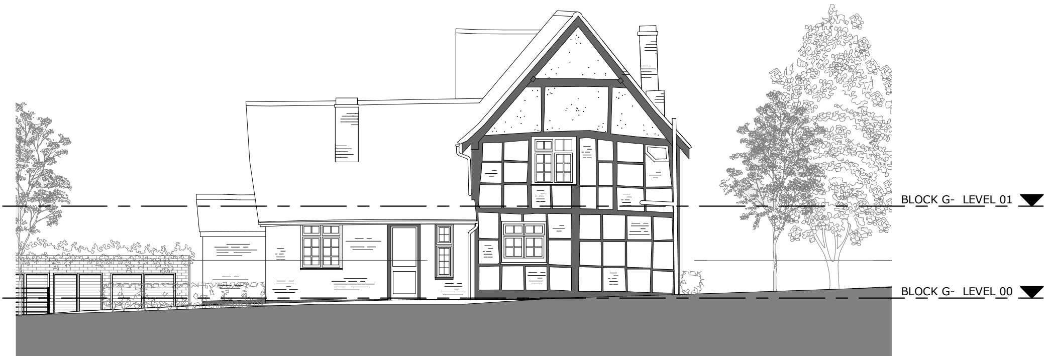
Block G - East Elevation SCALE: 1 : 100