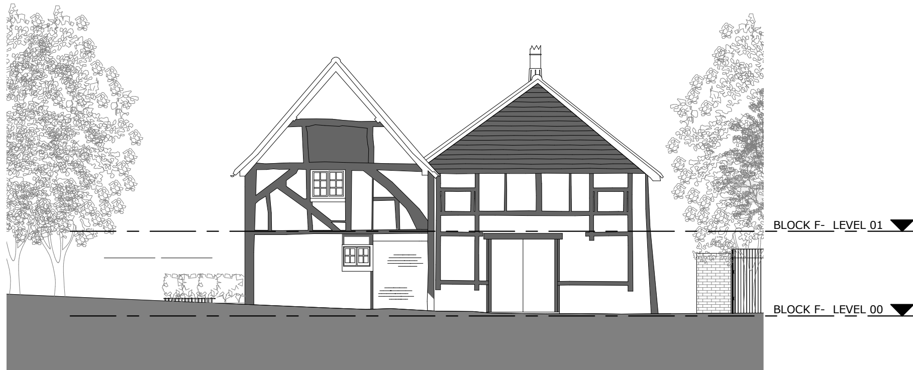
Block F - North Elevation SCALE: 1 : 100