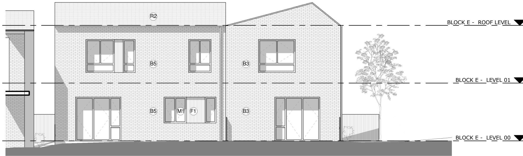
Block E East Elevation SCALE: 1 : 100