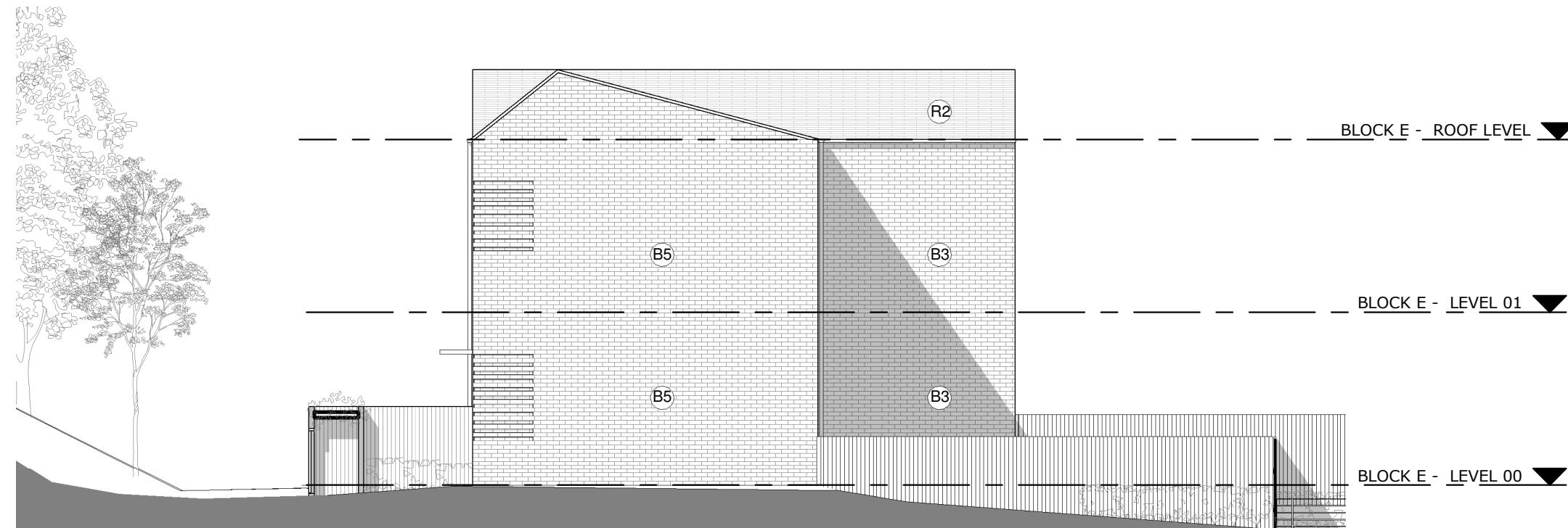
Block E North Elevation SCALE: 1 : 100