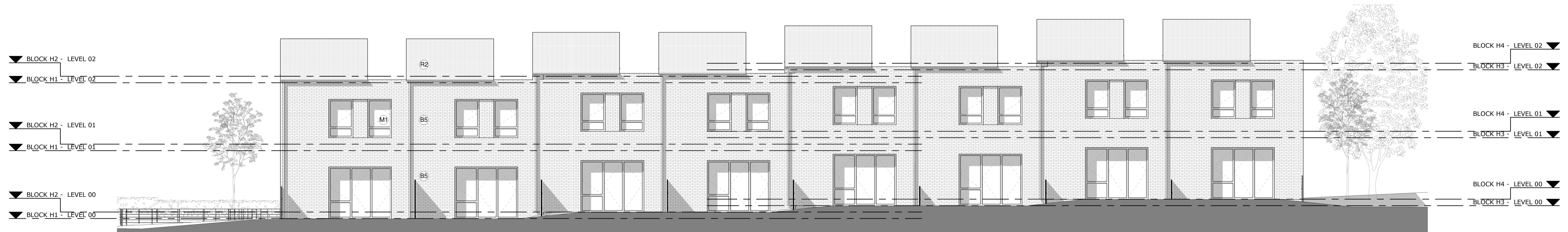
Block H East Elevation SCALE: 1 : 100