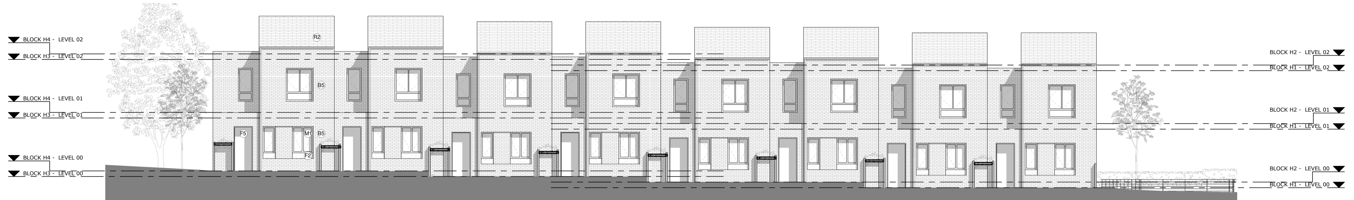
Block H West Elevation SCALE: 1 : 100