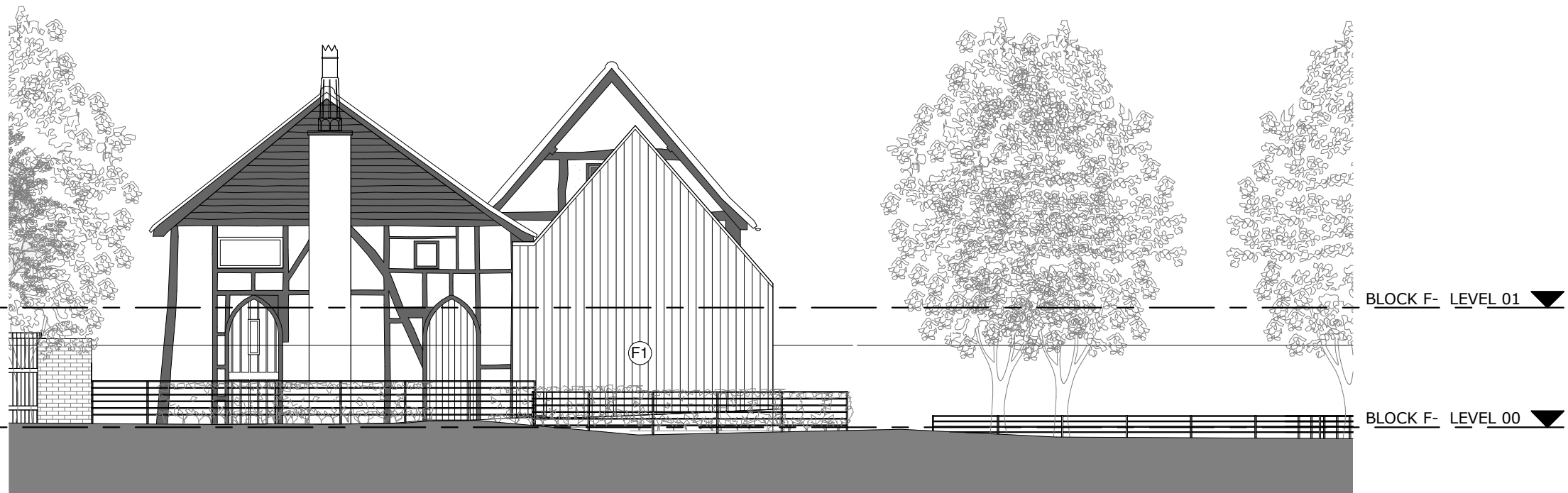
Block F - South Elevation SCALE: 1 : 100