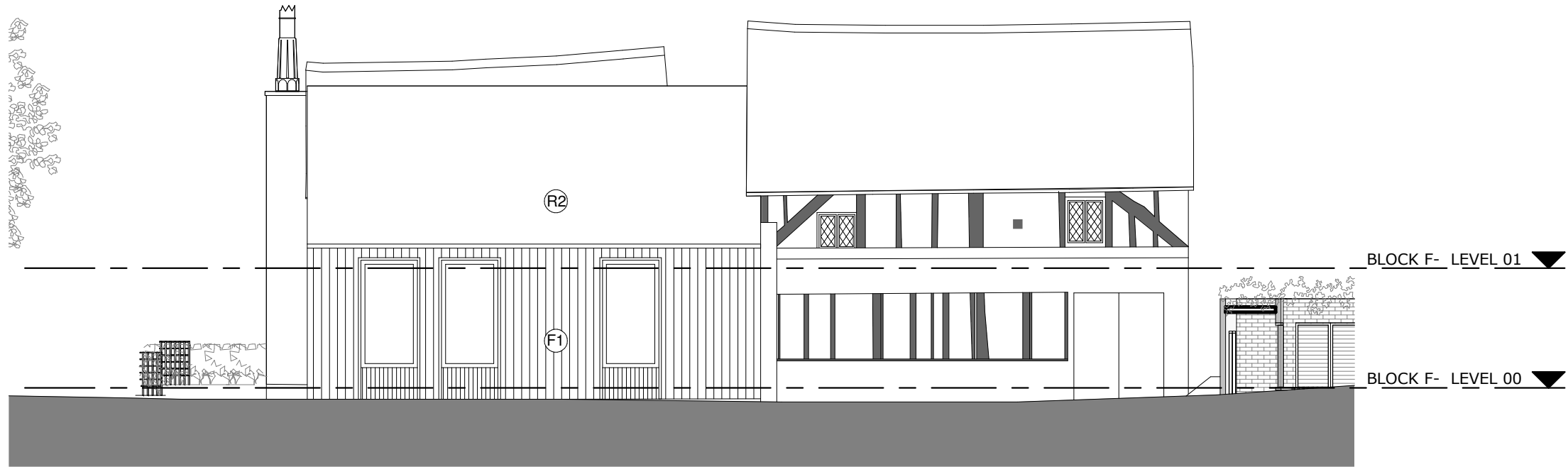
Block F - East Elevation SCALE: 1 : 100