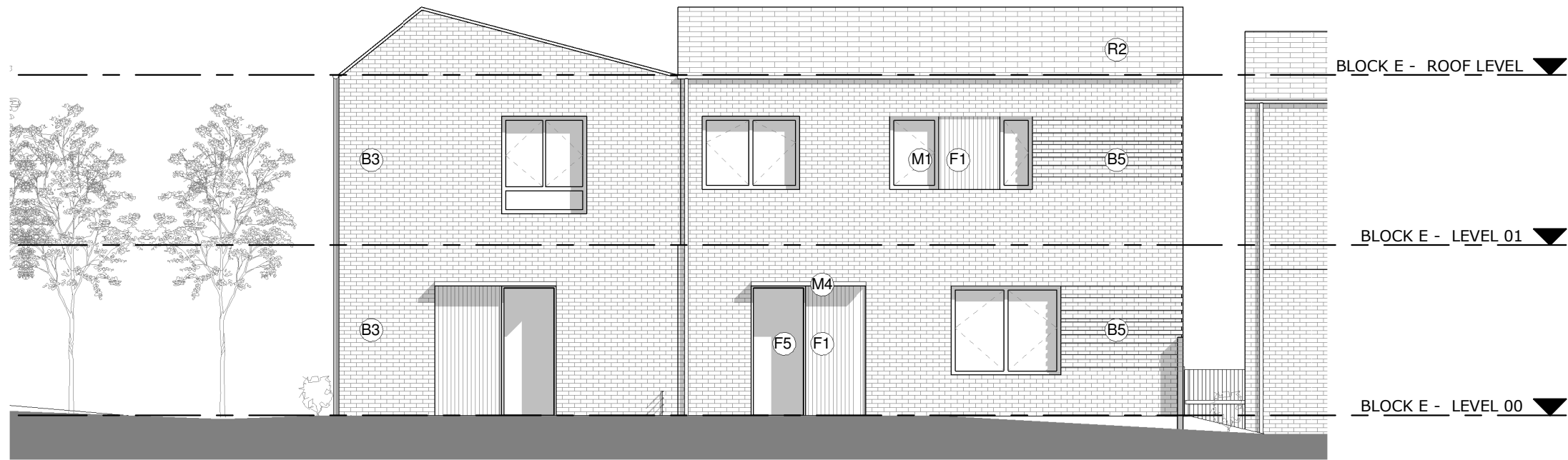
Block E West Elevation SCALE: 1 : 100