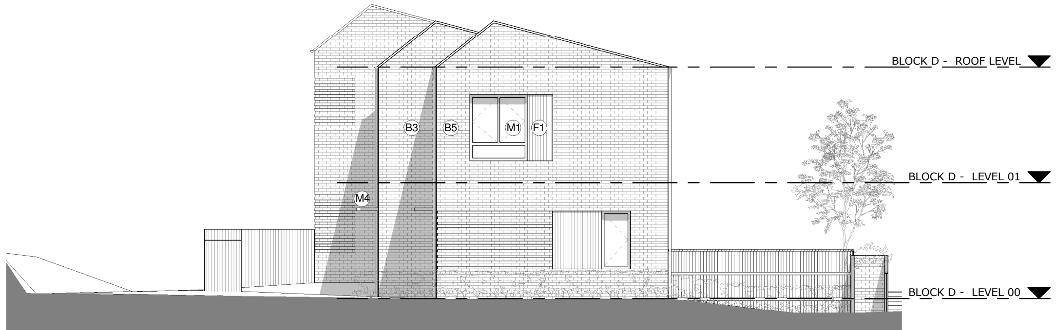
Block D South Elevation SCALE: 1 : 100