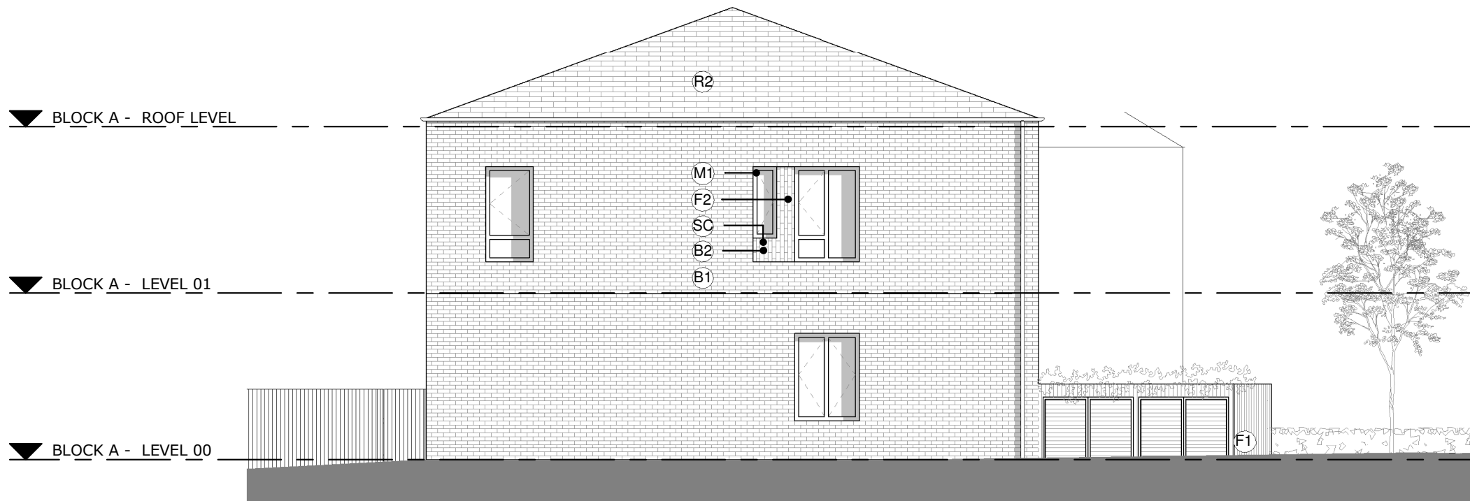
Block A North Elevation SCALE: 1 : 100