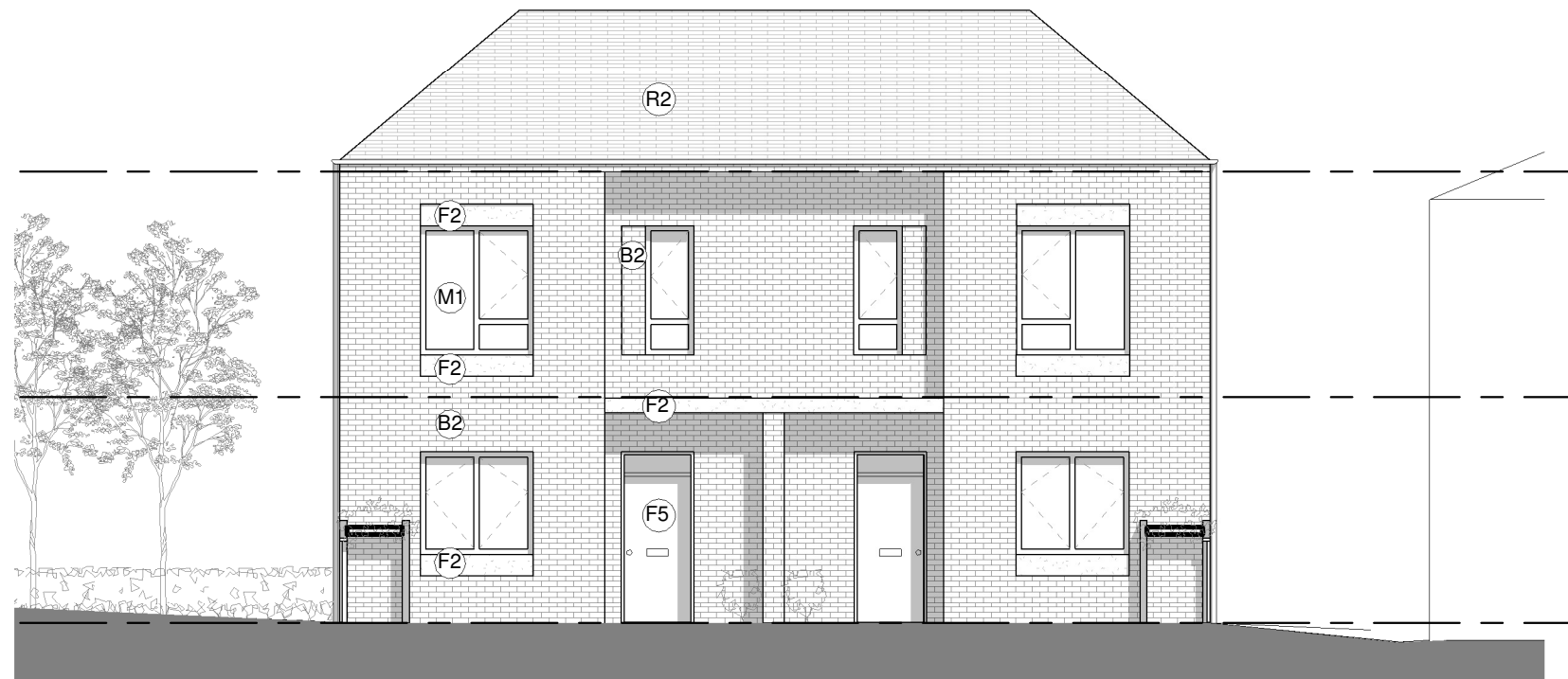
Block A West Elevation SCALE: 1 : 100