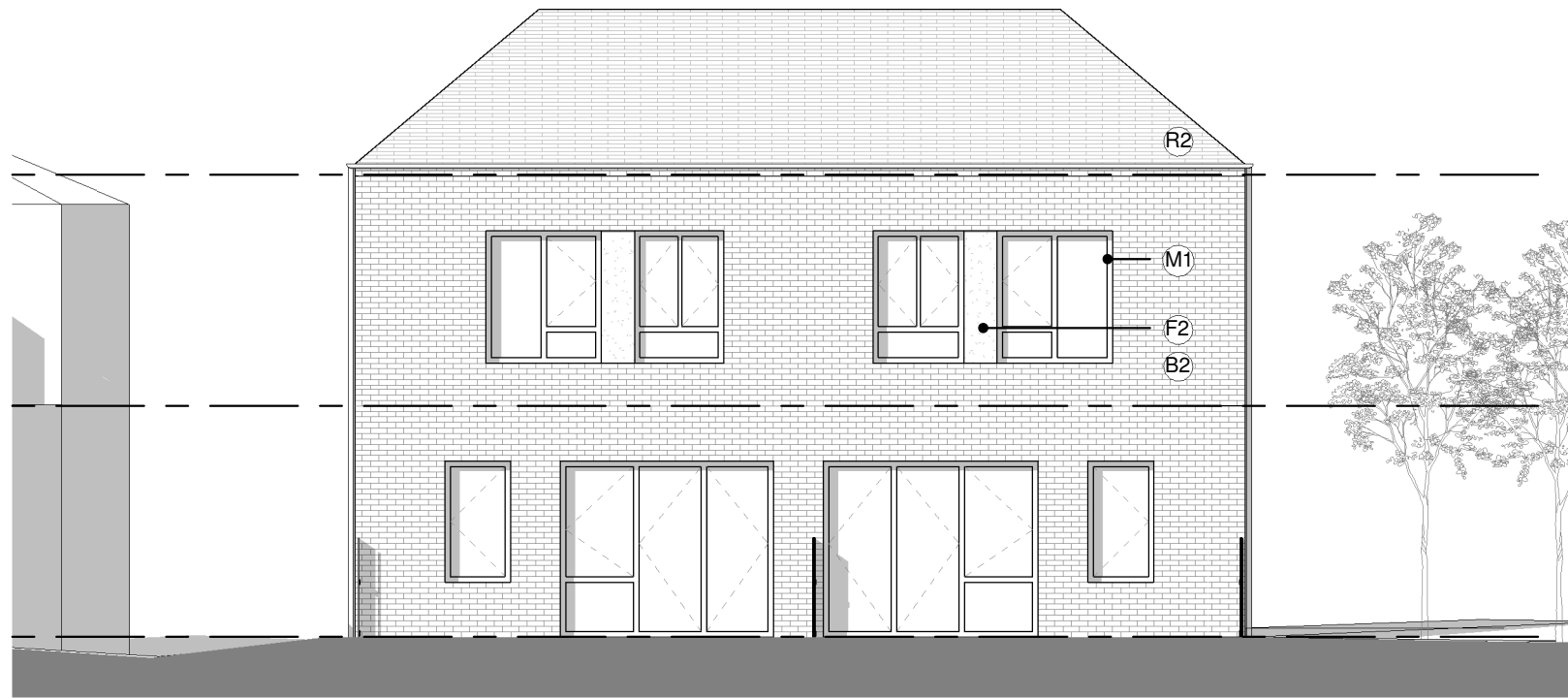
Block A East Elevation SCALE: 1 : 100