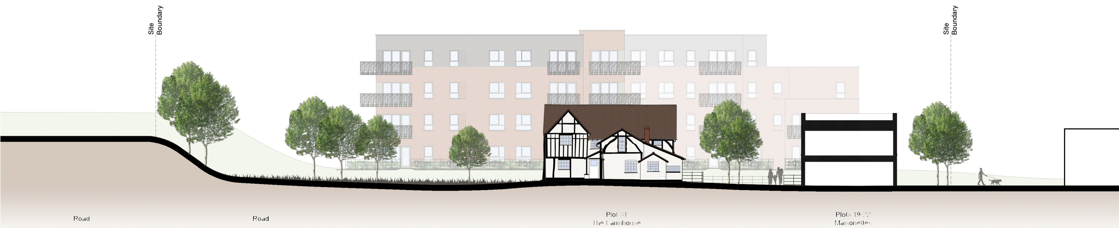
Section 1 - 1