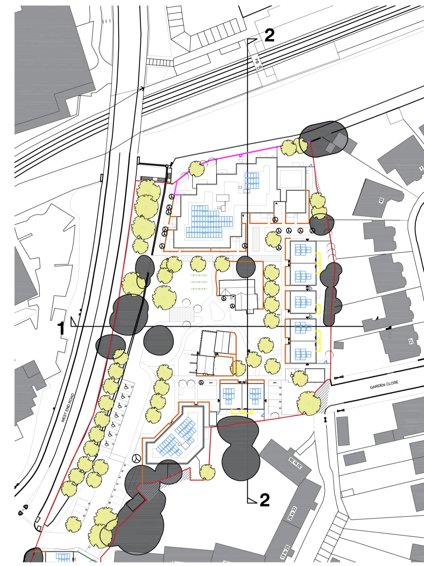
Key Plan (not to scale)