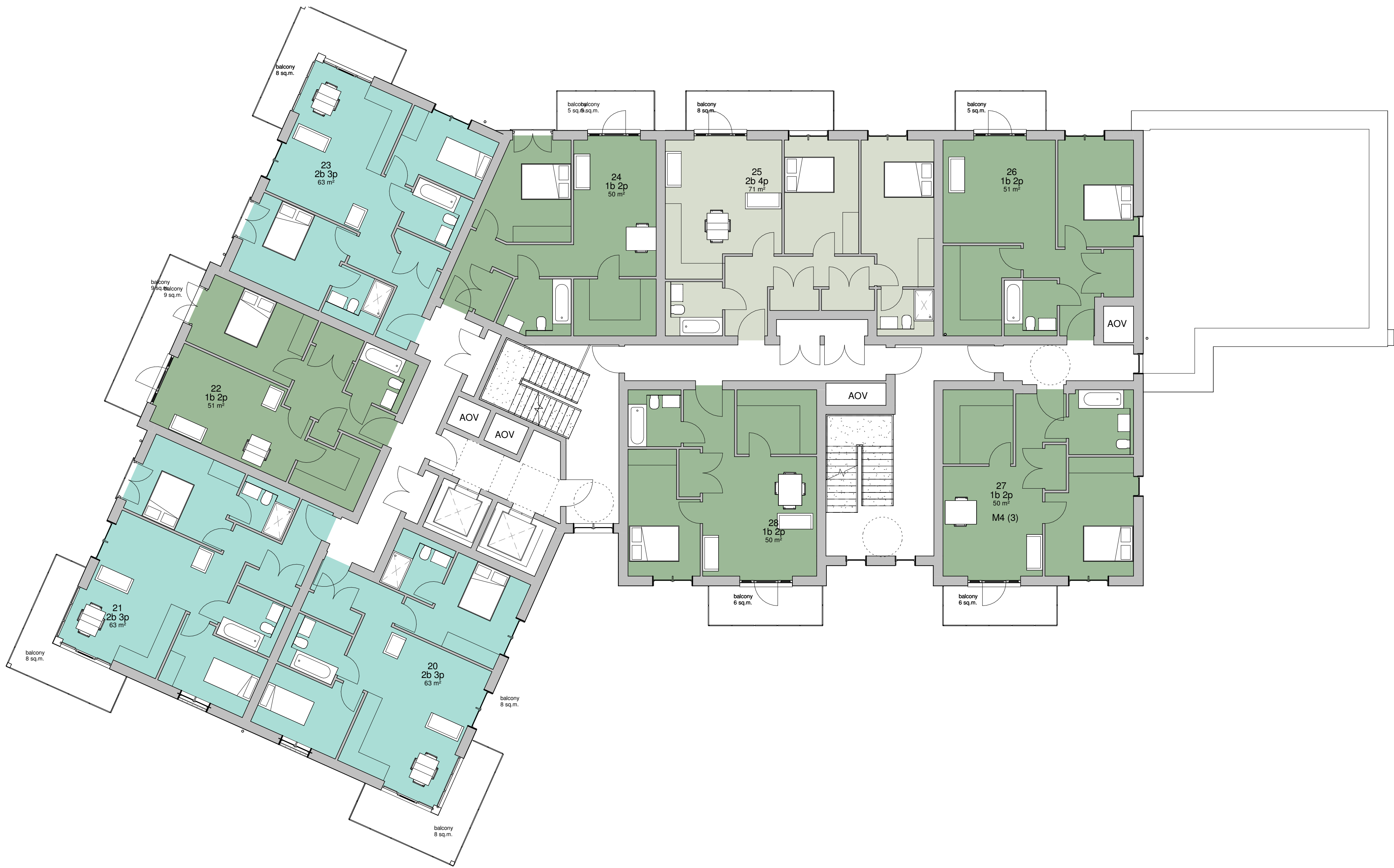
3. Second floor 1 : 100