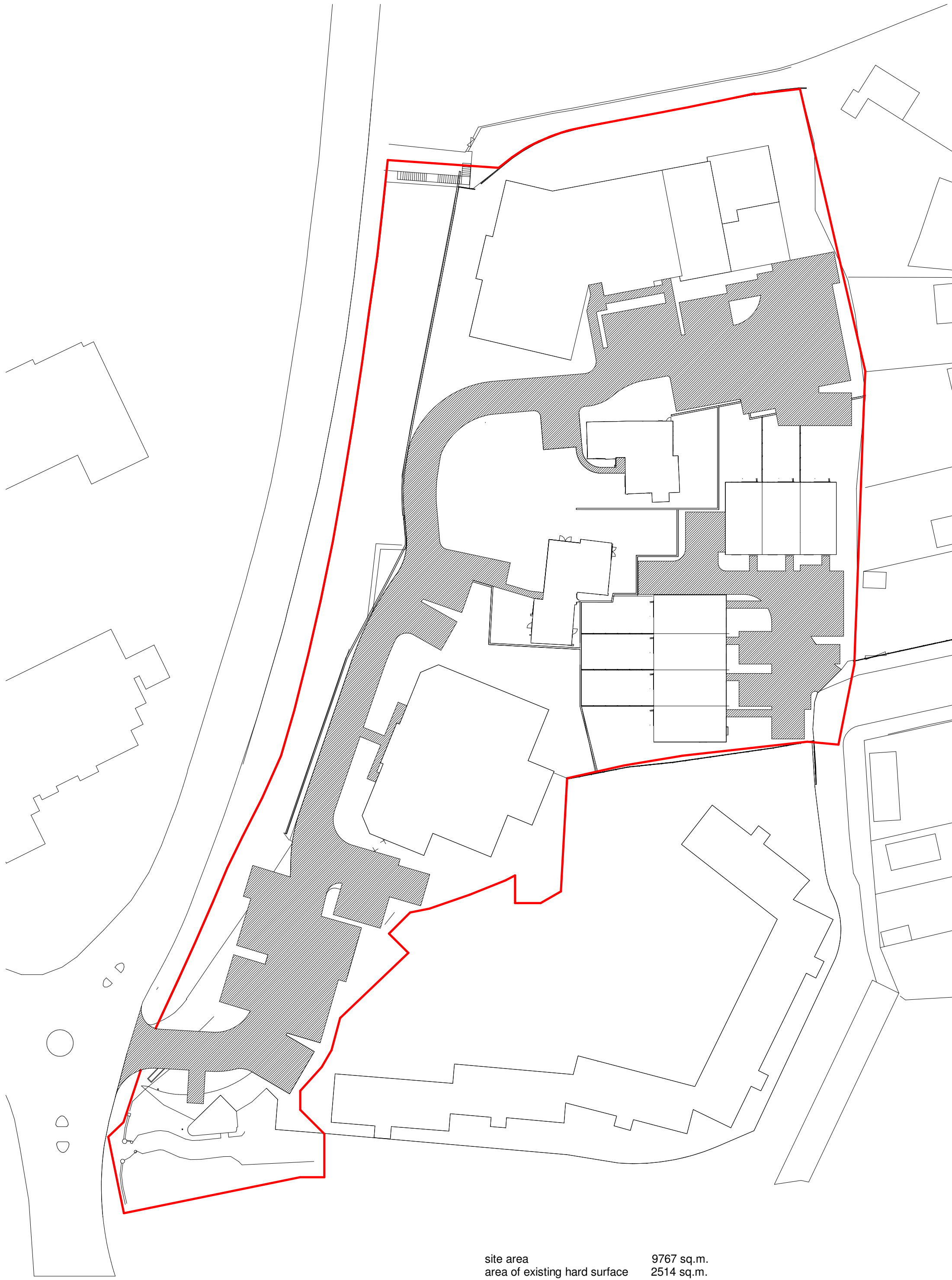
Proposed hard landscaping 1 : 500