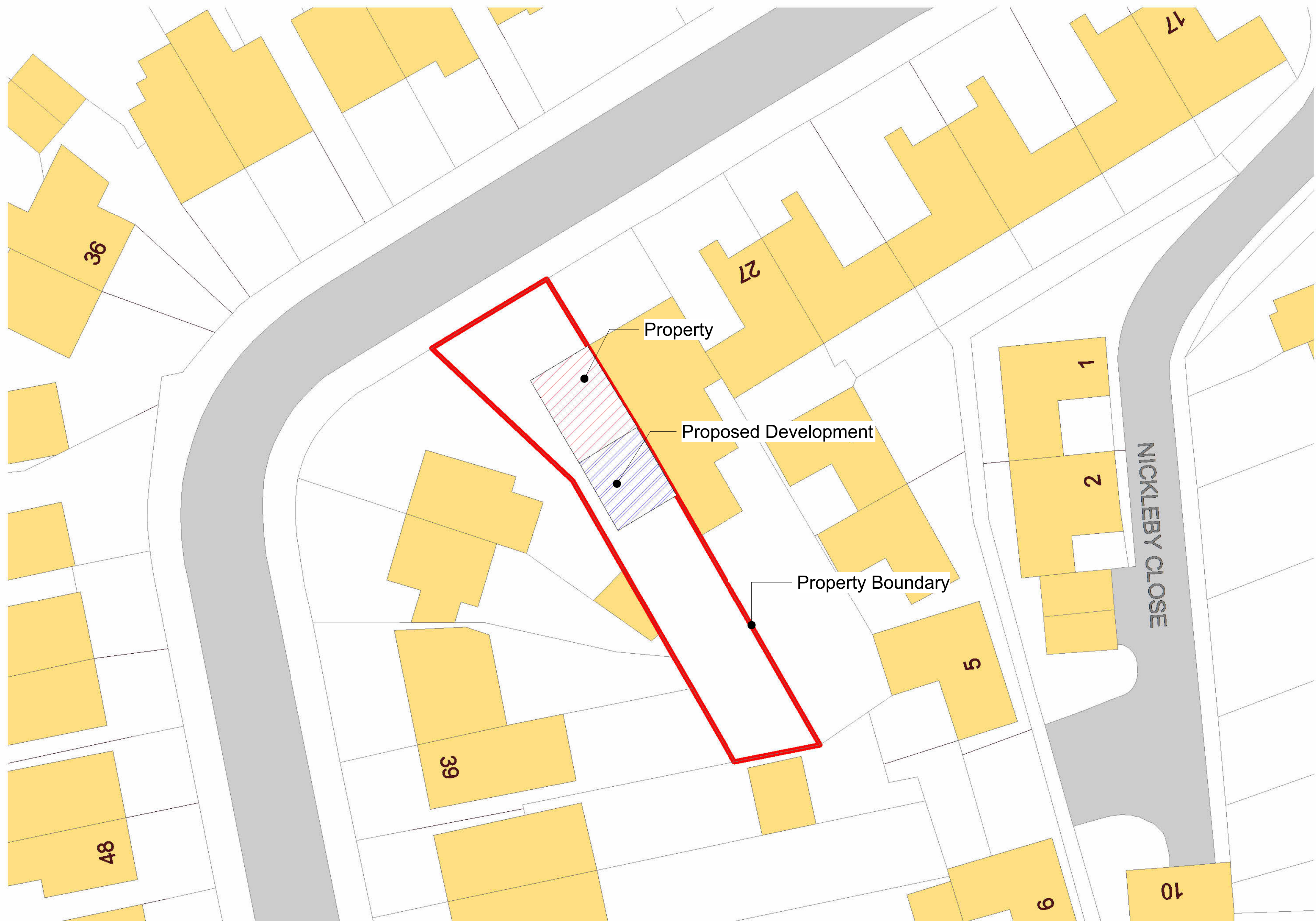
Location Plan 1 : 200