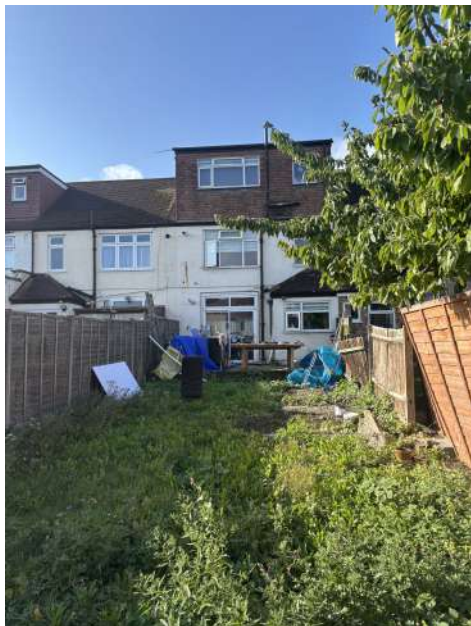
5. View showing adjoining building no.37