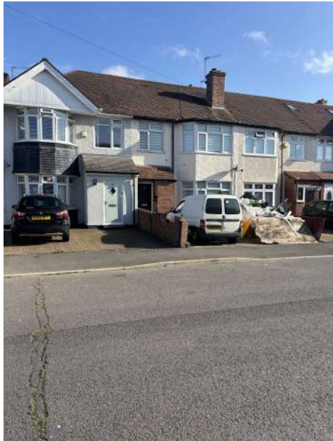
1. View from the opposite side of Richmond Avenue