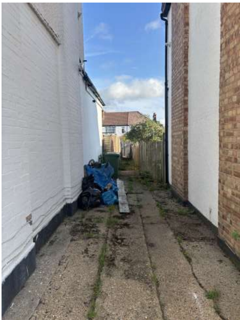
7. Alley way to the rear of garden