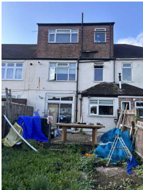
4. View of the rear of the house