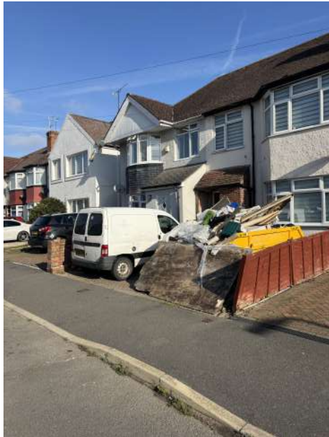
2. View from Richmond Avenue