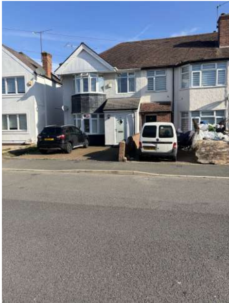
3. View from Richmond Avenue