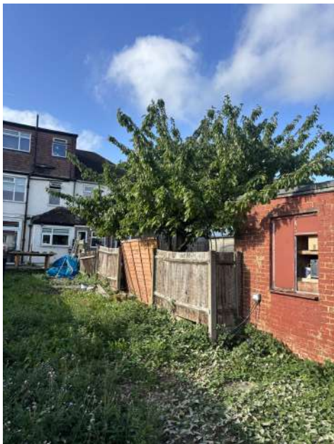
6. View showing adjoining building no.33