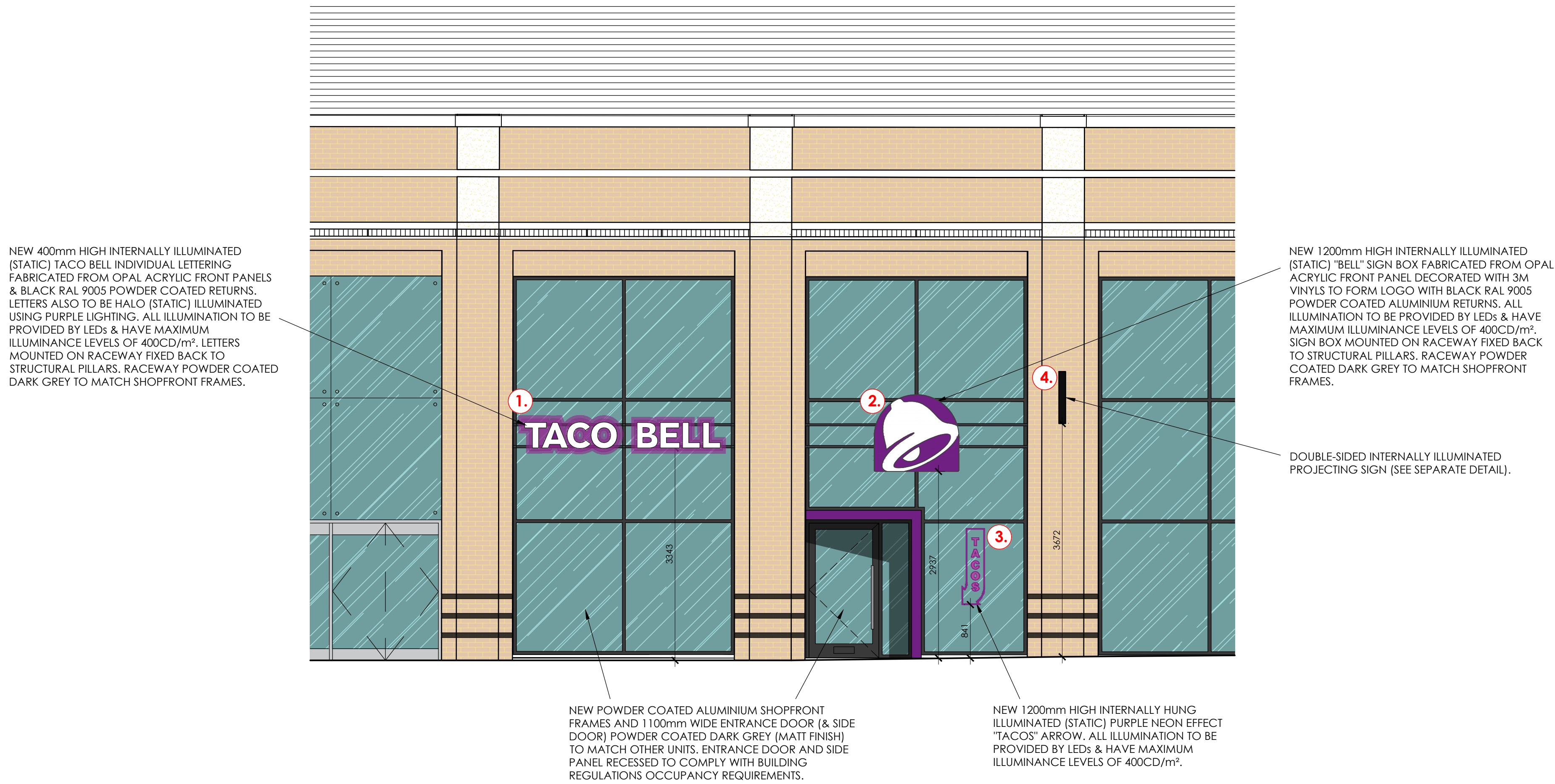
proposed High Street Elevation scale - 1:50 @ A1 / 1:100 @ A3