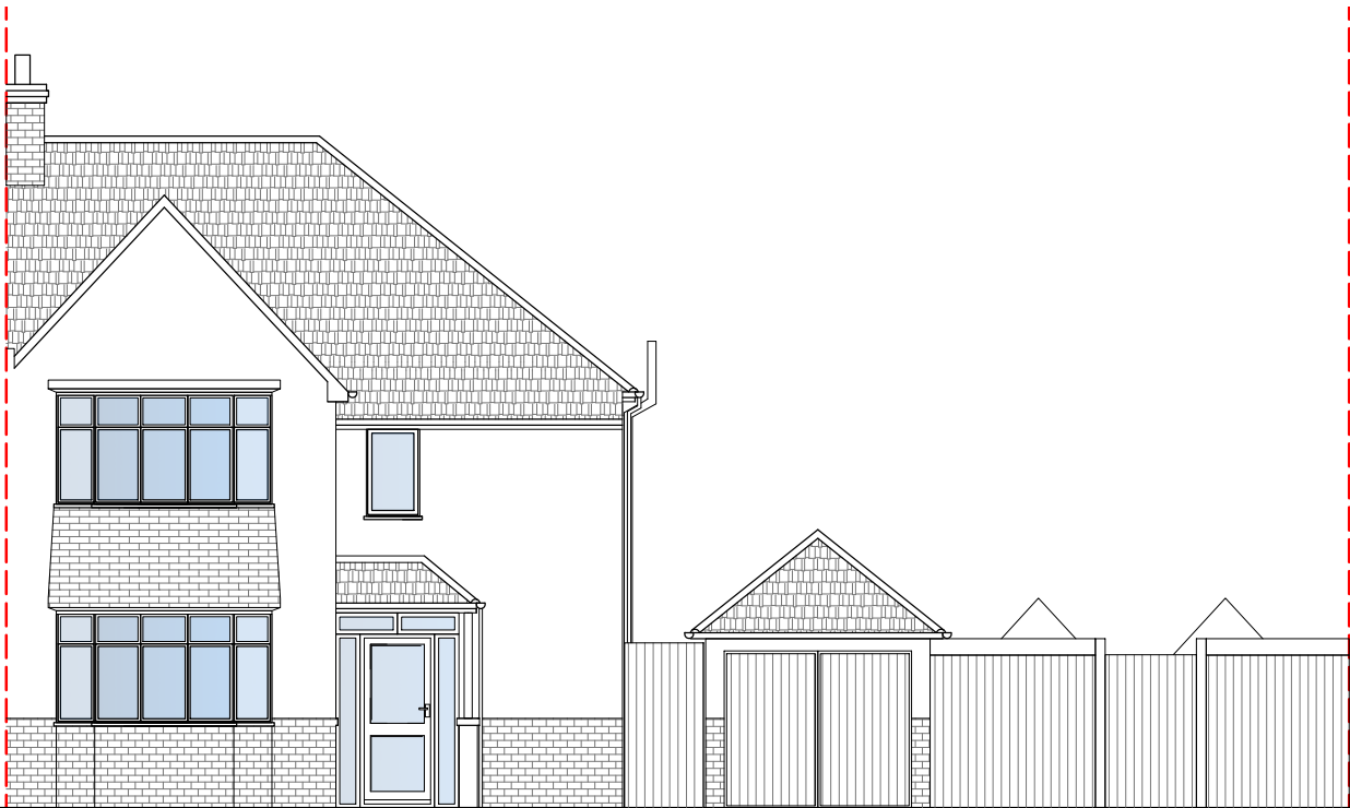
Existing Front Elevation Scale 1:100