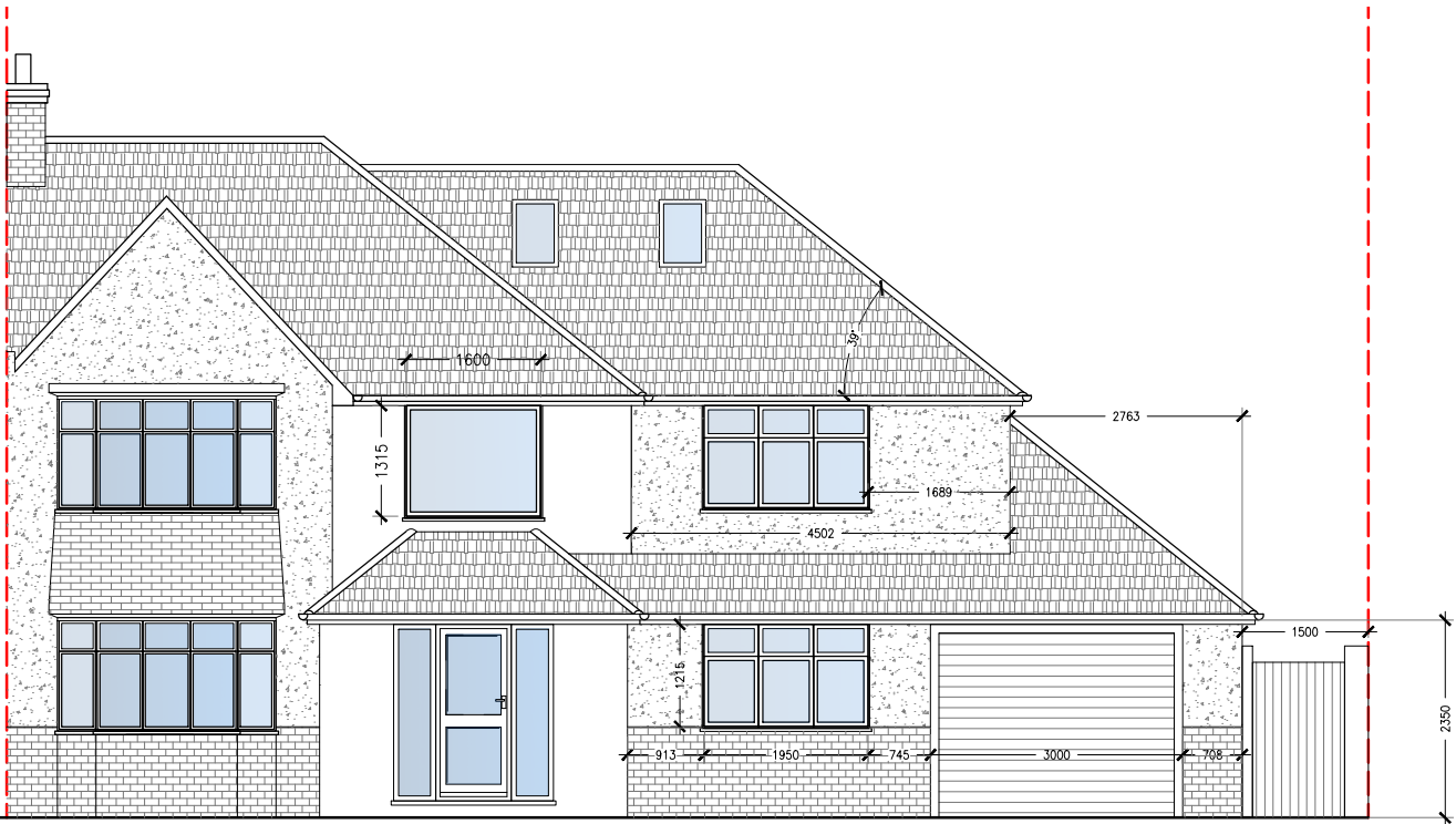
Proposed Front Elevation Scale 1:100