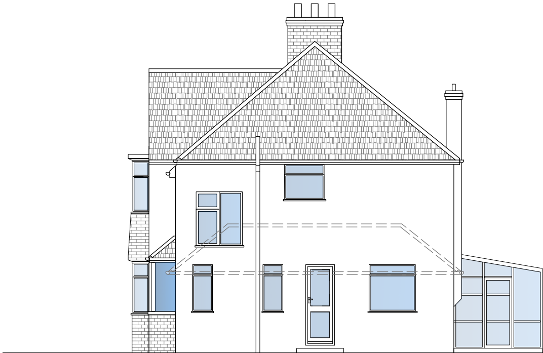
Existing Side Elevation Scale 1:100