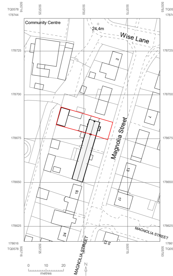
1 Proposed Block Plan 1 : 500