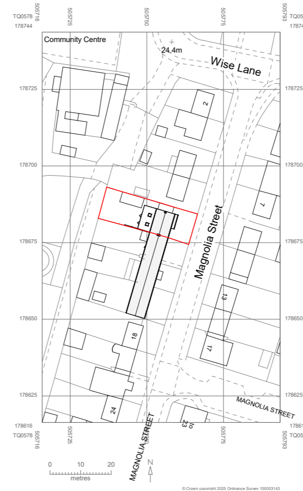
1 Proposed Block Plan 1 : 500